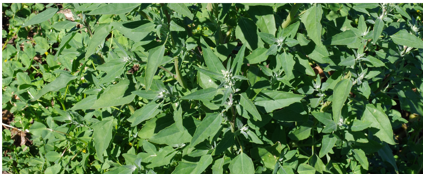
Figure 2 The rapid rate of growth and size of Fat hen make it highly competitive for resources with most vegetable crops.

Fat hen hosts a range of vegetable crop diseases in Australia and elsewhere around the world. These include: cucumber mosaic virus, bean yellow mosaic virus, potato virus, tobacco etch virus, turnip mosaic virus, and watermelon mosaic virus. In Australian vegetable production, fat hen has also been noted as a host of aphids.