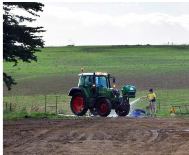
Figure 6 Establishing a fixed equipment wash-down bay can help restrict the spread of fat hen on the farm, particularly where it is not present at all or only present on part of the farm.

Farm hygiene may be less relevant for managing fat hen where it has already spread across the whole farm. Other difficulties associated with this approach include the time required to wash equipment down thoroughly, and the potential for uncontrolled spread in flood prone areas.