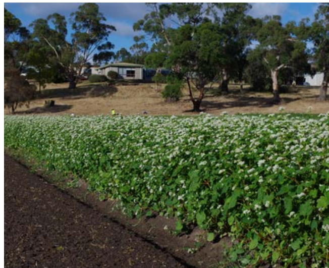
Figure 4 Newer cover crop varieties such as Buckwheat ( Fagopyrum esculentum ) appear to be effective in suppressing broadleaf weeds such as fat hen, as observed on this farm near Hobart, Tas.

Heavier crop residues may also reduce the impact of fat hen. In one overseas study, higher residues of corn crops left in the crop beds after harvesting reduced emergence of fat hen. More specifically, untilled plots saw a greater emergence of fat hen seedlings than tilled plots, but untilled plots with greater crop residue left behind were less prone to this weed species than comparable tilled plots.