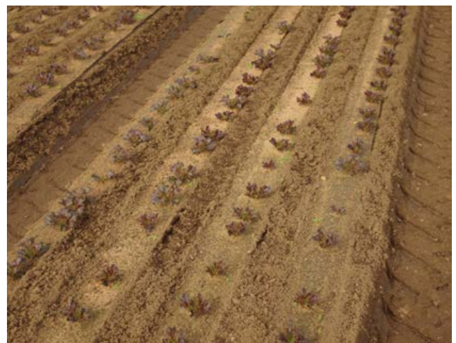
Figure 3 A shallow 'tickle' till within the crop row and between the plants early in their life cycle may help to manage recently germinated fat hen and other important broadleaf weeds, allowing the crop to form a canopy before the weed problem becomes significant within the rows. Relevance of this technique will depend on crop/s grown, and availability of intra-row tillage equipment.

Tillage type may also influence fat hen emergence. In one study, emergence of fat hen in chisel plough plots was far more significant than in comparative plots comprising no-till or mouldboard ploughing followed by cultipacking, in a corn production system.