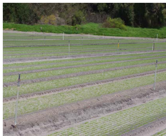
Figure 7 Diligent hand weeding over several seasons, utilised in combination with other weed management tactics, can result in almost complete eradication of weeds from the crop. In this paddock in Western Australia, farm staff were encouraged to remove all weeds by hand before seed set. They had succeeded in transforming a previously weedy paddock into one almost entirely free of weeds.

Slashing or mowing can be an effective fat hen control measure amongst younger plants where survival is impeded. However, it is critical to undertake such practices before the plants have had a chance to set seed, so that the problem is not made worse in following seasons by spreading viable seed. Fat hen has been shown to be sensitive to flaming.