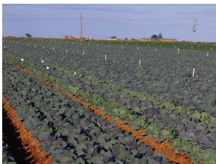
Figure 5 Ensuring appropriate planting density to allow good coverage of the crop beds can be useful along with other techniques (such as tillage and pre-plant/pre-emergent herbicide application) to suppress fat hen and other weeds effectively within the crop beds, as this example of a brassica crop near Werribee, Vic, illustrates.

Where it is appropriate to the crop, higher plant density and variety selection (including shading of wheel tracks where this is possible) may contribute to reduced fat hen impact in the longer term.