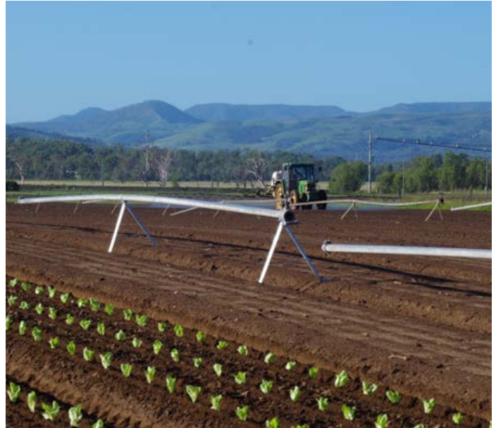
Figure 8 Pre-plant or pre-emergent herbicides are often one of the key techniques for management of fat hen in broadleaf vegetable crops, such as this lettuce crop near Gatton, Qld.

Some examples of herbicide resistant fat hen populations are noted in the table below, with a focus on products that are registered for use in Australian vegetable production. In general, management of resistant populations for these products has involved rotating to other herbicide options, relying more heavily on other management approaches such as tillage, or potentially using a higher rate of the herbicide in question to control plants showing resistance traits (more effective against smaller plants than larger plants).