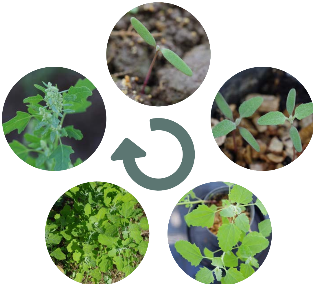
Figure 1 Life stages, from germination to flowering

Figure 1 includes a series of photos of fat hen at different life stages in order to facilitate correct identification on-farm, from a young seedling through to a mature flowering plant.