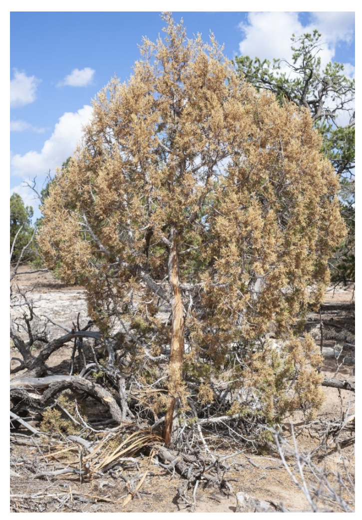
Bark is removed to show phloem and xylem.

the larvae follow as they chew away on the phloem are called galleries and are easy to spot once the bark is removed. Since I am not an entomologist this may be an oversimplification. I have posted several aerial videos on YouTube, Vimeo and Facebook showing the die-off in several locations. Some videos include live larva.