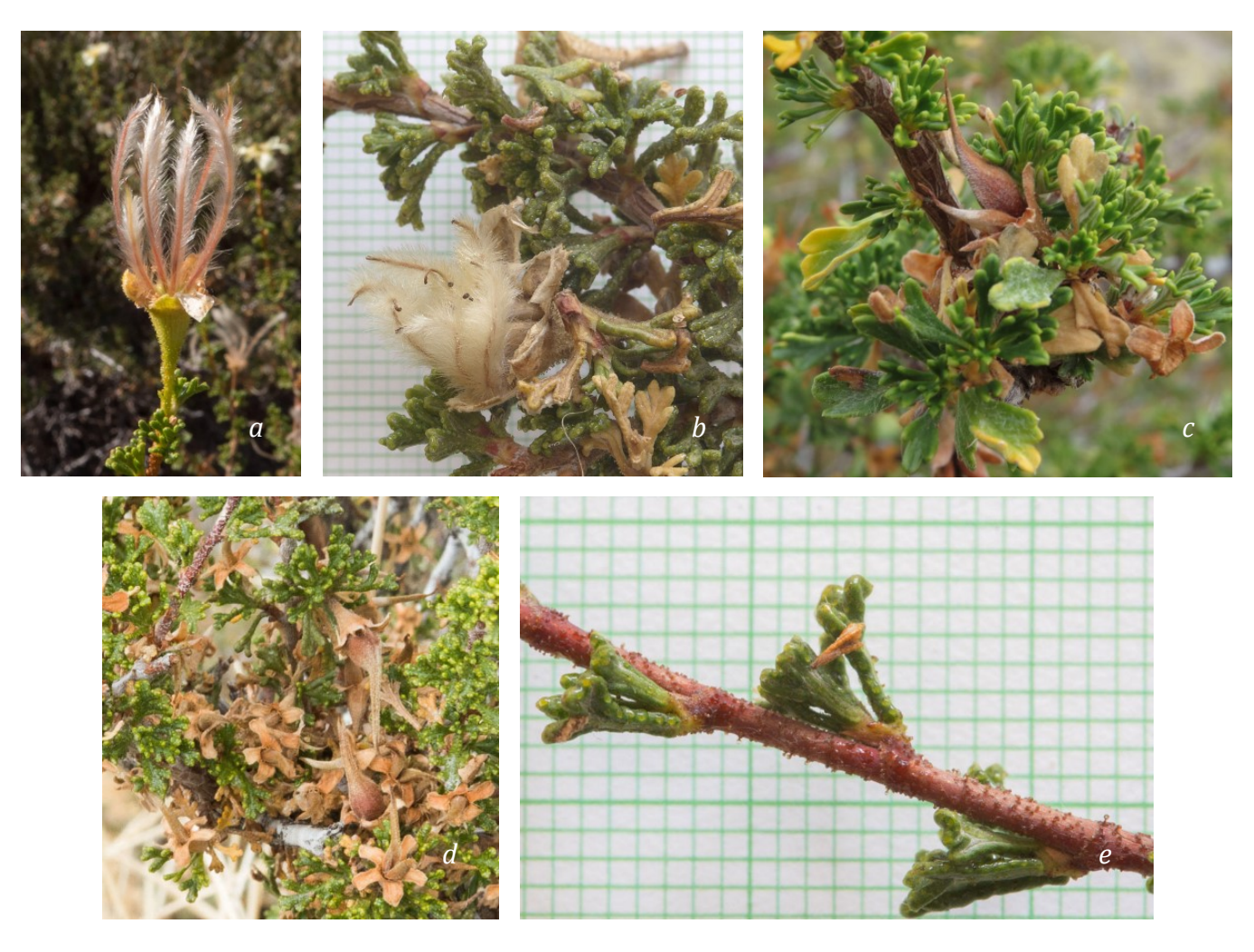
Figure 2. Leaves and seeds of Purshia: (a) Cliffrose, Purshia stansburyana with normal plumose seeds; (b) Cliffrose, Purshia stansburyana with infertile seeds, probably pollinated by Purshia tridentata ; (c) Bitterbrush, Purshia tridentata showing flat non-glandular leaves and non-plumose seeds; (d) Desert Bitterbrush/Hybrid Purshia glandulosa with multi-lobed glandular leaves and non-plumose seeds; (e) Desert Bitterbrush/Hybrid Purshia glandulosa , young stem with highly glandular twig and tridentate glandular leaves.

Cliffrose (Fig. 2a) normally sets many small seeds per flower, each bearing a lovely feathery plume: the seeds readily disperse in late summer, leaving an empty cup. Mismatched pollen may still produce many seeds (Fig 2b) but these remain stunted and fail to disperse: they can stay around into the winter and beyond. Leaves of Cliffrose are usually narrow, multi-lobed, tightly rolled back at the edges, and have glands which start out sticky but dry out chalky. The individual Cliffrose in Figure 3, surrounded by Bitterbrush, but with several other Cliffrose plants nearby, has both kinds of seed.