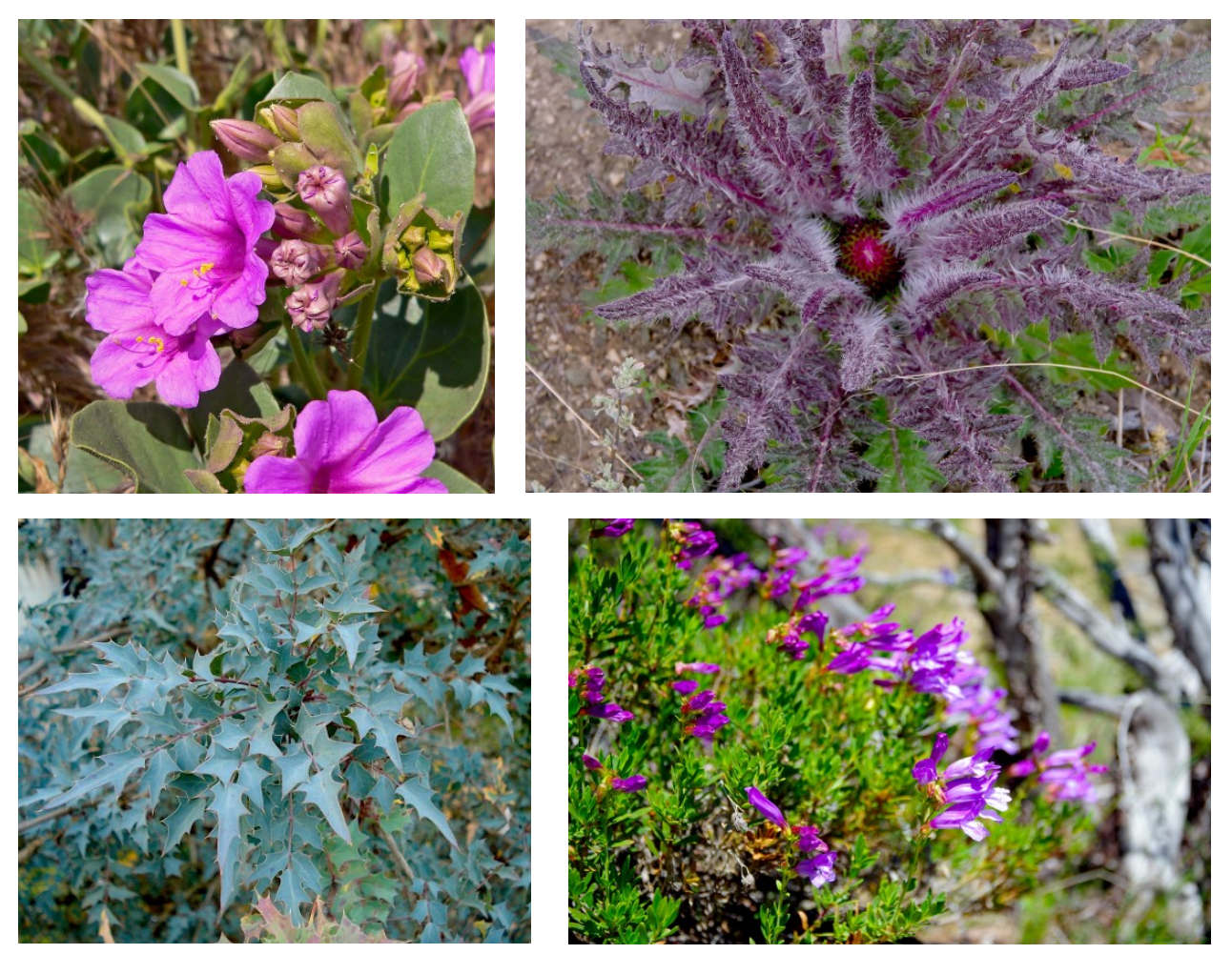
Clockwise: Mirabilis multiflora, Cirsium foliosum, Mahonia fremontii, and Penstemon fruticosus.

flowering Wyethia amongst a blanket of white Mule-ears ( Wyethia helianthoides ), and a dark purple Elk Thistle ( Cirsium foliosum ). The thistle wasn't a keeper for our propagation efforts but we gawked over the beauty of it anyway.