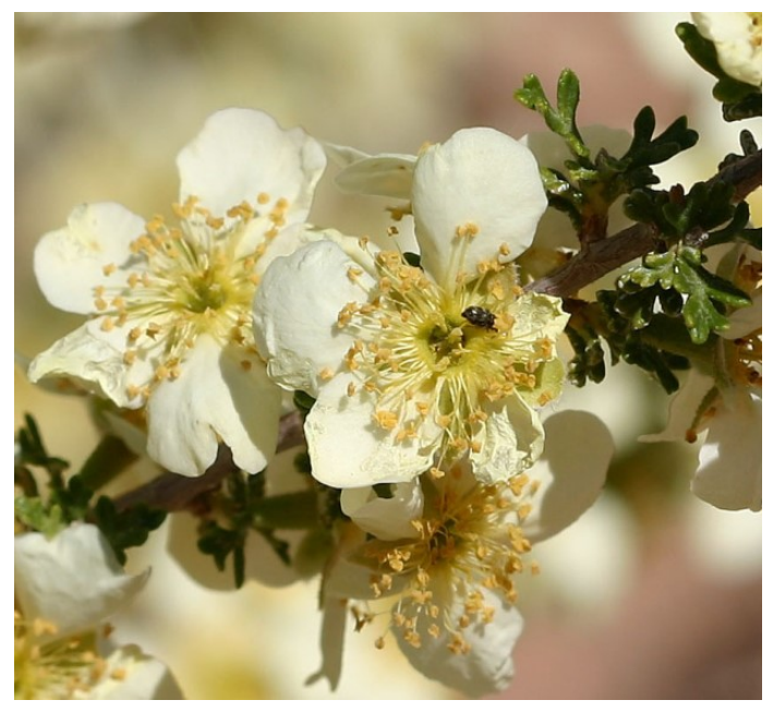
Figure 1. Flowers of Cliffrose ( Purshia stansburyana ). Note the multi-lobed glandular leaves near top.

In the words of Wikipedia This article is a stub . It is basically a short introduction to what could be a fascinating story, but there are presently more questions than answers. This coming Spring offers a chance for UNPS members to help gather field data even while the questions are being formulated. If you read this and feel that you might be interested in contributing please contact me and I will send details of how best you can help – it could be as simple as keeping your eyes open while walking the dog.