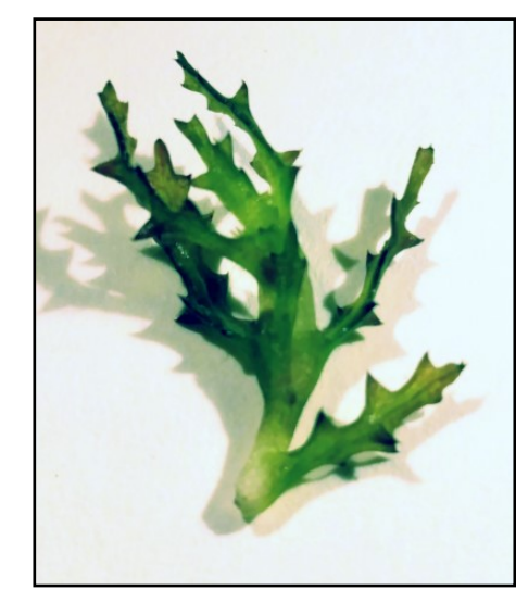
Najas marina L.