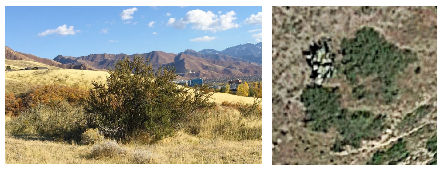
Figure 3. Cliffrose and Bitterbrush coexisting: (a) a single robust plant of Purshia stansburyana is surrounded on 3 sides by heavily browsed Purshia tridentata . Other plants of Purshia stansburyana occur very close by so the main plant receives pollen from both species – and produces both normal and infertile seed; (b) the same plants as seen from the air in a Google Earth Image dated 6/4/13.

Bitterbrush (Fig 2c) usually sets only one or infrequently two much larger seeds, bristly, but not plumed. Leaves are almost all 3-lobed, non-glandular, but hairy. They occur in two distinct forms. Some are flat, about as broad as they are long, and rarely persist through the winter in the Salt Lake area. Leaves on new twigs are narrow and tightly rolled, lasting out the winter as a target for deer.