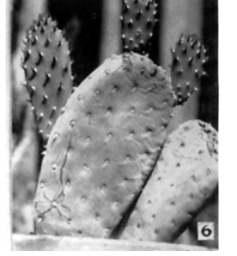
Clover, page 418

The two northernmost Basilares varieties that occur in Utah are isolated from one another with significant barriers that separate them in terms of both deep canyon systems as well as exceptionally harsh landscapes. It seems logical that var. heilii might have originated from plants that were spread northward via the Dirty Devil River. Currently we have no information with respect to whether any O. basilaris plants occur north of confluence of the Dirty Devil River with the Colorado River. Plants strongly resembling var. longiareolata are known from Cataract Canyon and seem to have influenced Opuntia in the Needles District growing within a relatively short distance from the river. An Atwood collection in 1991 places it potentially within less than 10 miles south of the Grand County line and is