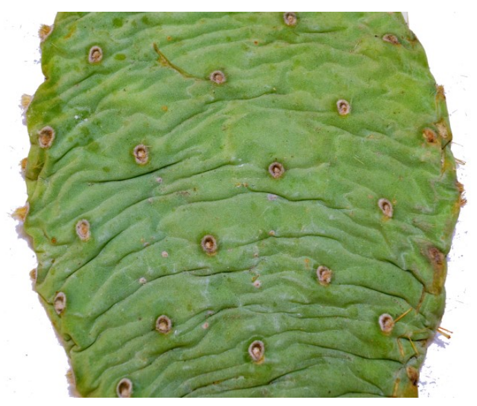
Opuntia basilaris v. heilii pad.

The three taxa largely occupy very distinct plant communities. As with Opuntia in general, they hybridize when they come into contact with other species in the genus which can then lead to intermediate forms and confusion. Var. heilii and var. longiareolata however are disjunct from one another by at least 40 aerial miles and are separated by exceptionally rugged terrain.