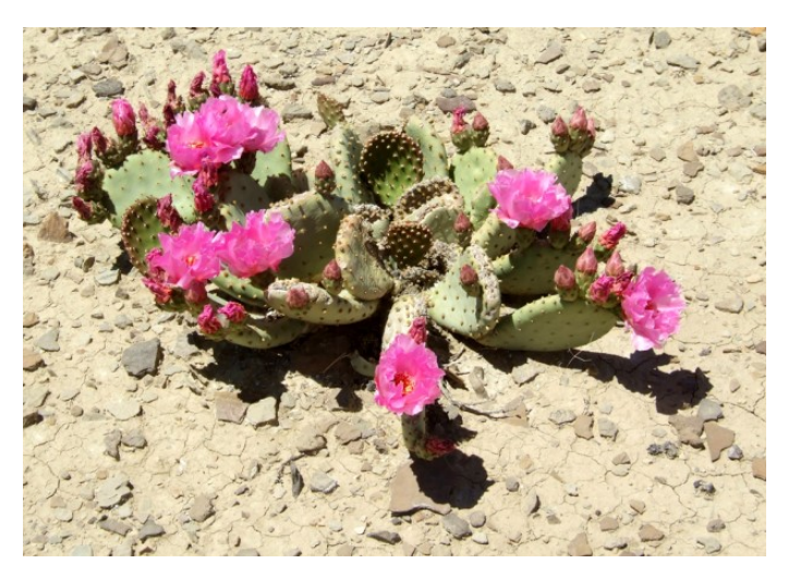
Woodruff 2012 plant of Opuntia basilaris v. heilii