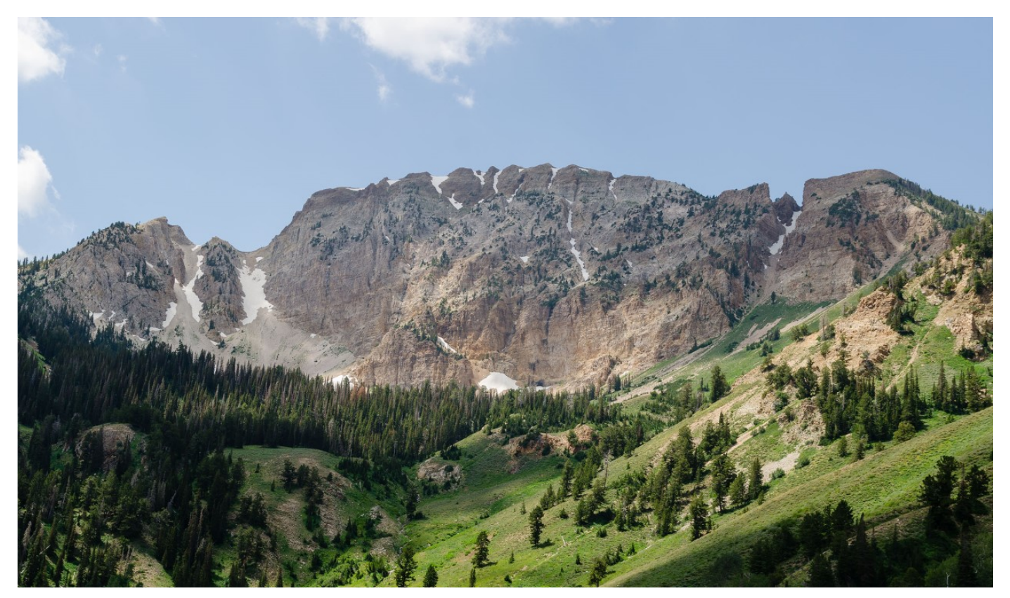
East face of Deseret Peak showing couloirs.

The range has a length of 28 miles and a width of 13 miles...The elevation ranges from 4200 feet in the valleys to 11,031 feet at the summit of Deseret Peak...Structurally, the Stansbury Mountains are a "gigantic eastward tilted fault block". The western escarpment rises abruptly from the floor of Skull Valley and is dissected by steep-walled canyons. The eastern side of the range is generally less rugged except in the vicinity of Deseret Peak, where Pleistocene glacial activity has produced sheer canyon walls and several well-defined horns formed from coalescing glacial cirgues. At least 17 cirgue basins, two of which contain small lakes, occur in the range. Skirting the base of the range are terraces, wave-cut cliffs, spits, and other features produced by Lake Bonneville. Pediment surfaces, bajadas, and alluvial fans are present on the western and eastern edges of the range.