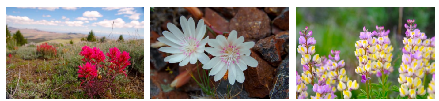
Castilleja angustifolia, Lewisia rediviva, and Lupinus arbustus.

disciplines. We spent the week discussing genomics, collecting plant samples, and dodging large mud puddles with our rigs. Some of the more interesting species were Bush Penstemon ( P. fruticosus ), a cross between White-flowered and Low Penstemon ( P. pratensis x humilis ), large fields of Northwest Indian Paintbrush ( Castilleja angustifolia ), mixed with Pale Indian Paint brush ( C. inverta ), Bitteroot ( Lewisia rediviva ), Brown's Paeonia ( Paeonia brownii ), a single light yellow