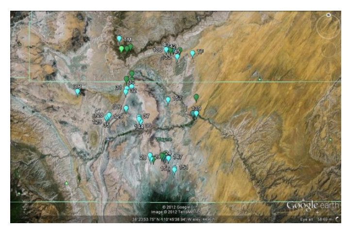
Woodruff 2012 distribution of Opuntia basilaris v. heilii

found right along/near the Colorado River in expected habitat. Var. longiareolata in fact seems to be content with remaining within the river drainage systems in Utah and Arizona whereas var. heilii grows in completely different, exceptionally harsh habitats. Regardless of the reason for those habitat preferences, there seems to be clear genetic differences between the two taxa that cannot be attributed solely to soil types or other environmental factors.