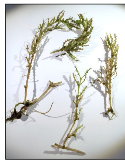
Najas marina L.

The specimen received by UTC, was entangled in Zannichellia palustris L. Specimens of each were made and images taken prior to pressing. Duplicate specimens have been made and will be distributed to other herbaria, and the label data and images are now available on-line.