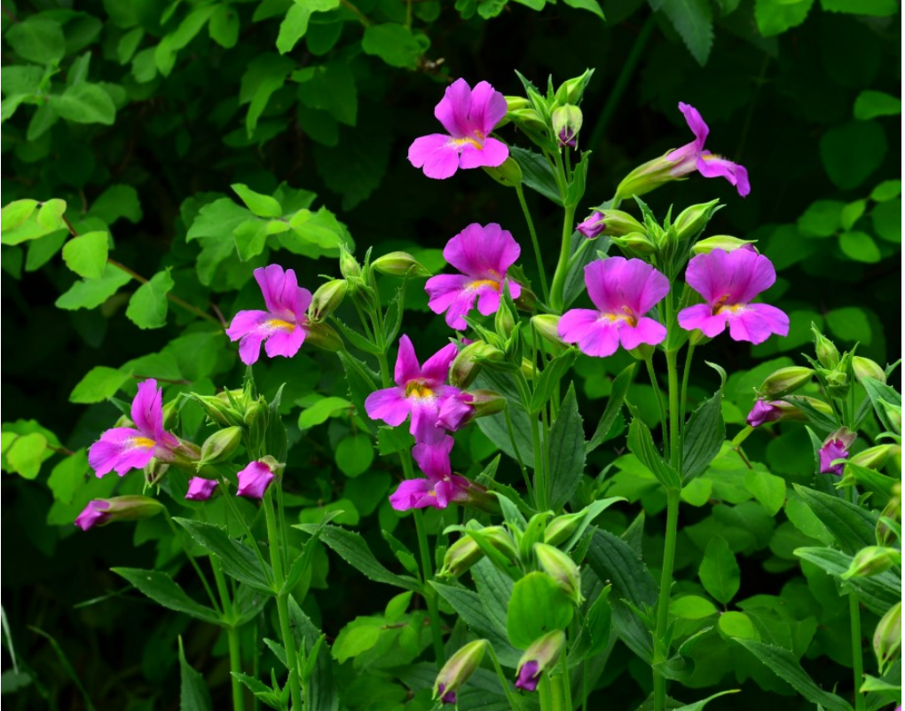
Lewis' Monkeyflower, Mimulus lewisii.

I've gone beyond this little paradise twice – once to South Willow Lake, and once up to Deseret Peak and then back down around the other side of the loop. If you go to South Willow Lake, you'll see the occasional beautiful spot. But the best is in the glacial hummocky