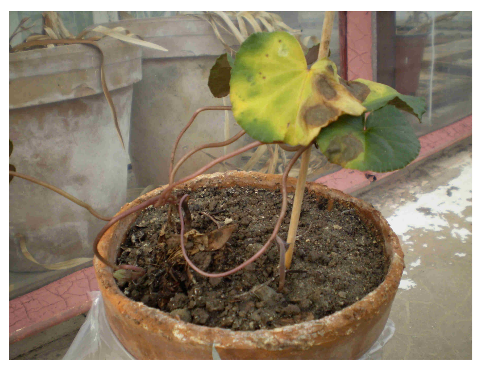
Fig. 4. Leaf spots of Cyclamen fatrense artificially inoculated with Septoria cyclaminis .

Received: March 17<sup>th</sup> 2009 Revised: October 4<sup>th</sup> 2010 Accepted: October 4<sup>th</sup> 2010