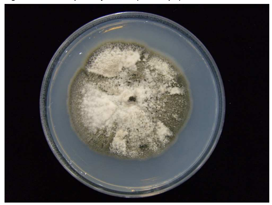
Fig. 3. Four weeks' old colony of Septoria cyclaminis on PDA.