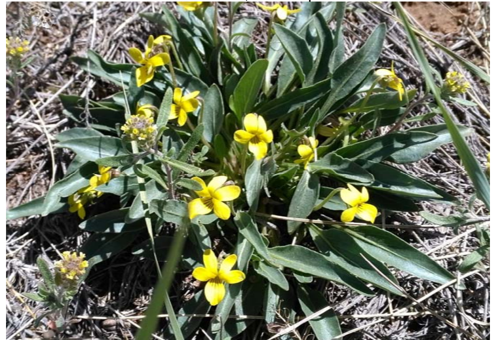
Viola nuttallii , Nuttall's violet