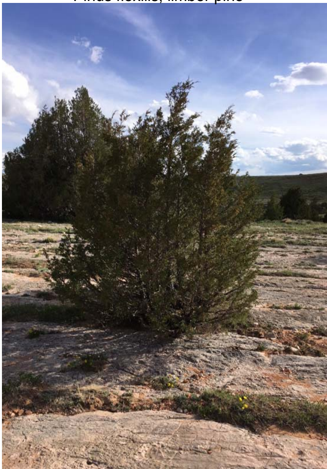
Juniperus scopulorum , Rocky Mountain juniper