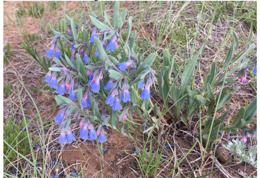
Mertensia lanceolata , prairie bluebells