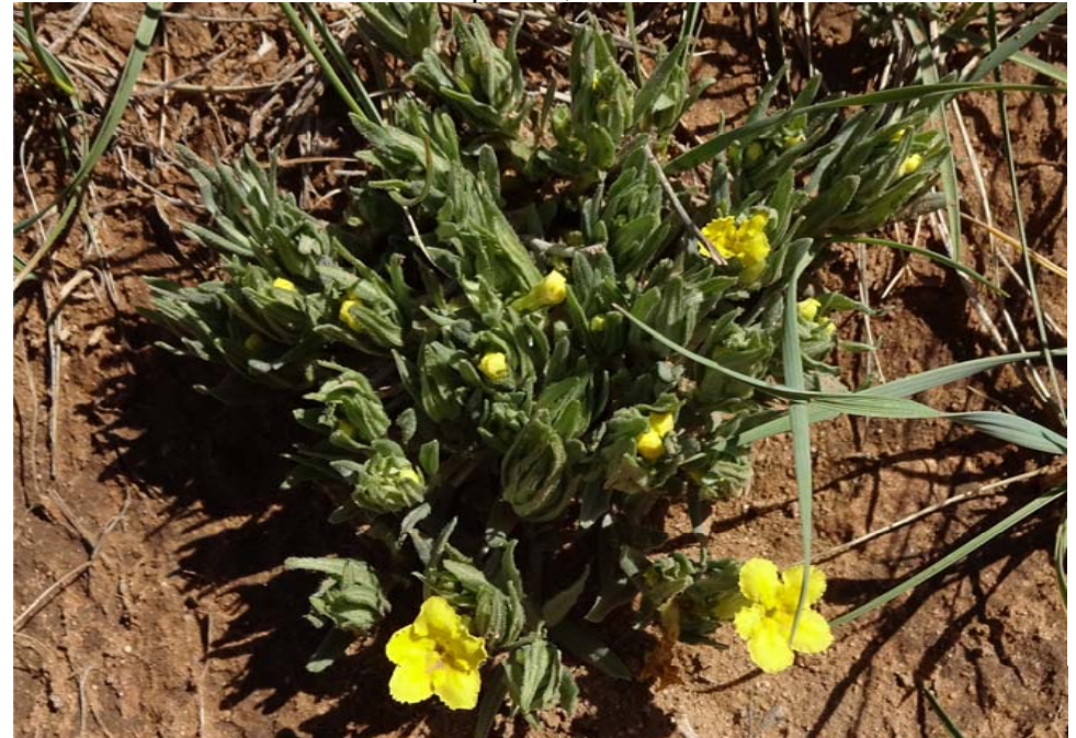
Lithospermum incisum , narrowleaf stone seed