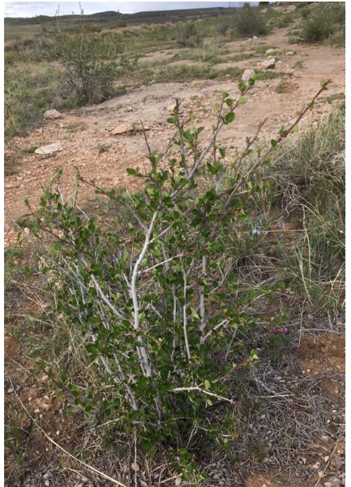
Cercocarpus montanus , alderleaf mountain mahogany