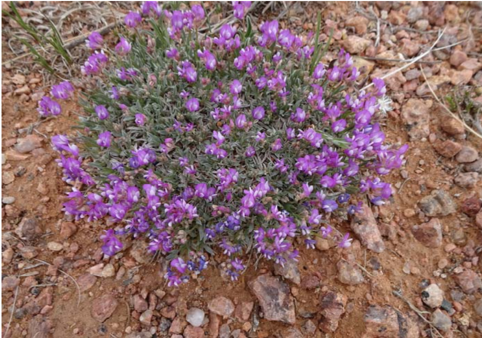
Astragalus spatulatus , Tufted milkvetch