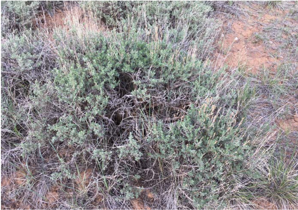
Artemisia nova , black sagebrush