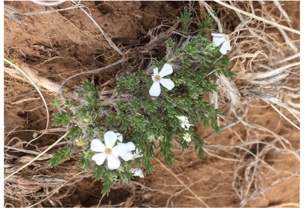
Phlox hoodii , Hood's phlox