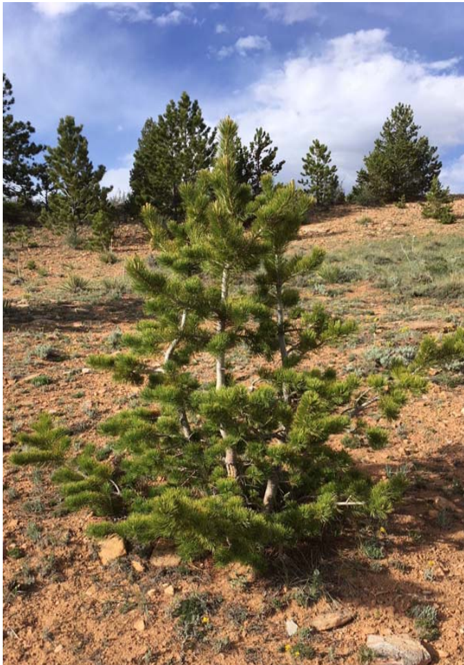
Pinus flexilis , limber pine