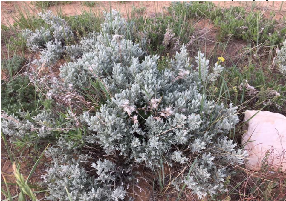
Krascheninnikovia lanata , winterfat