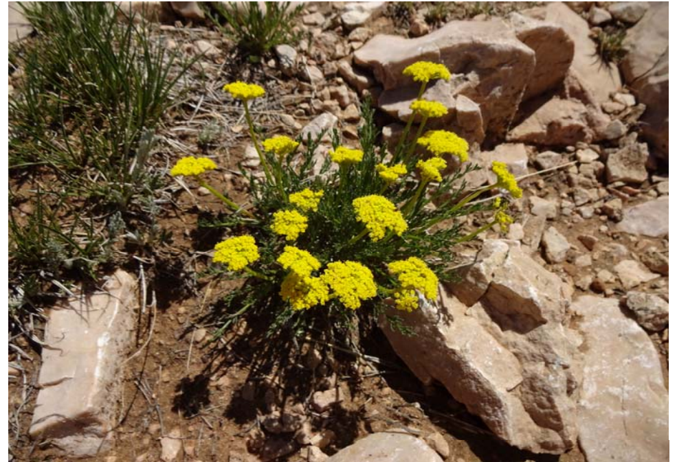
Muscineon tenuifolium , slender wildparsley