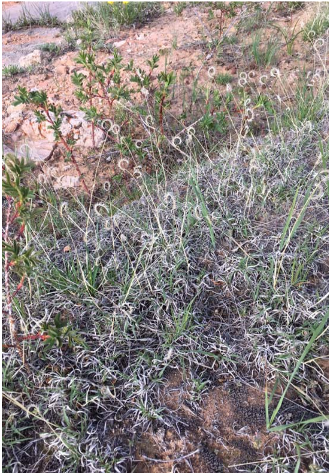
Bouteloua gracilis , blue grama