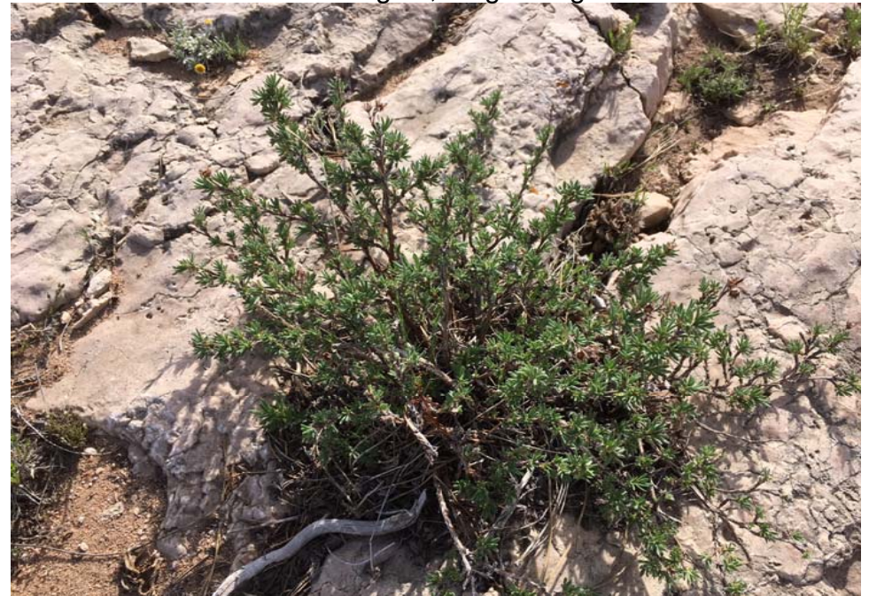
Dasiphora fruticosa , shrubby cinquefoil