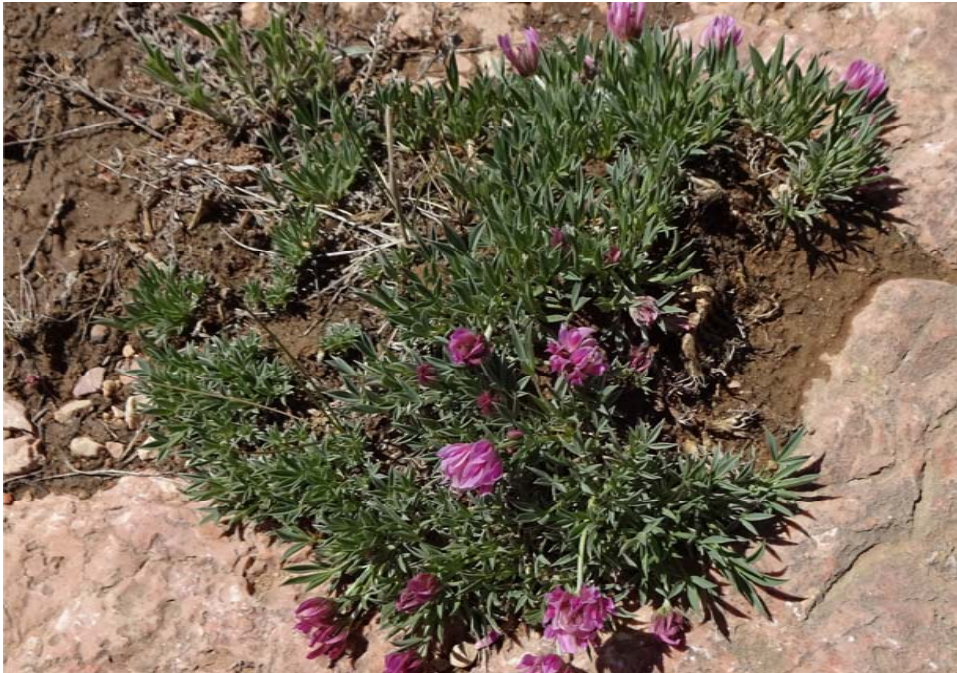
Trifolium dasyphyllum , alpine clover