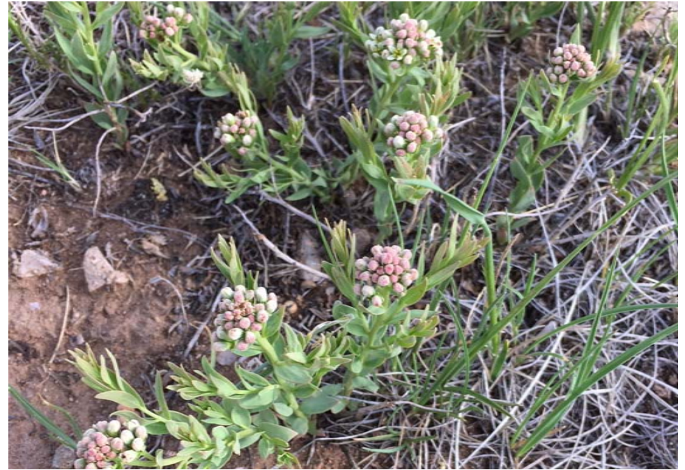
Comandra umbellata , pale bastard toadflax