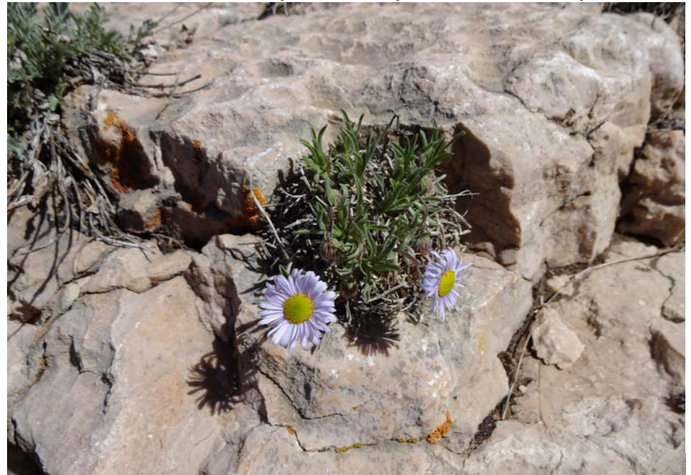
Erigeron caespitosus , tufted fleabane