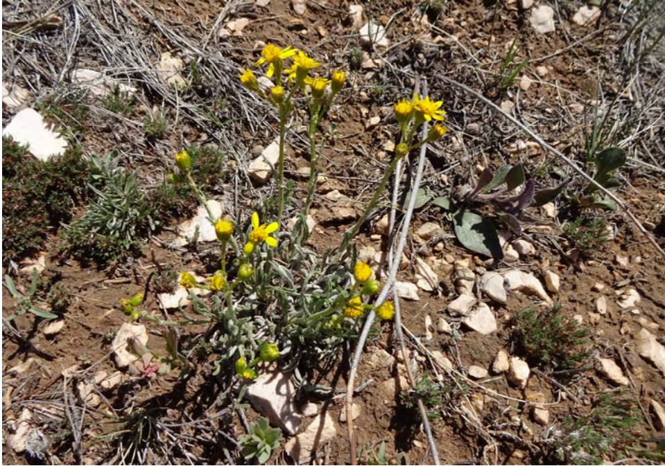
Packera cana , woolly groundsel