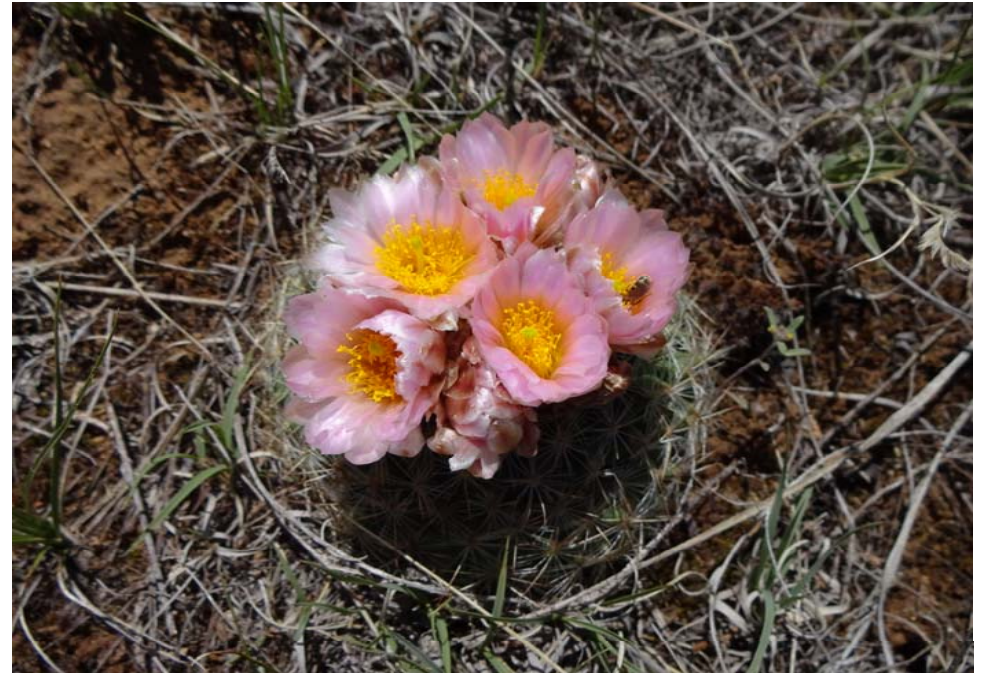
Pediocactus simpsonii , mountain ball cactus