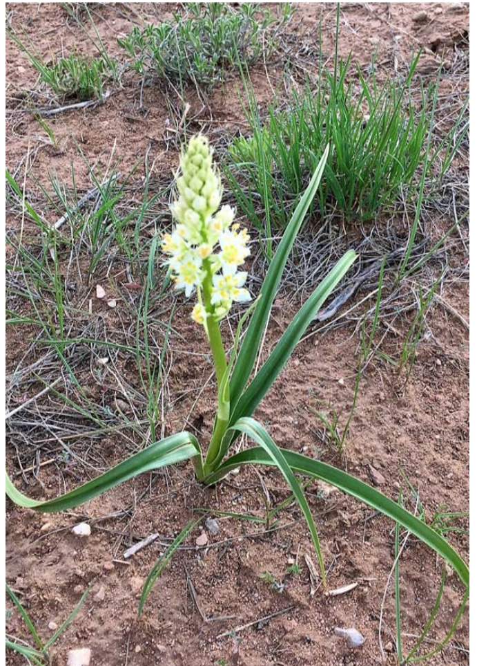
Zigadenus venenosus , meadow deathcamas