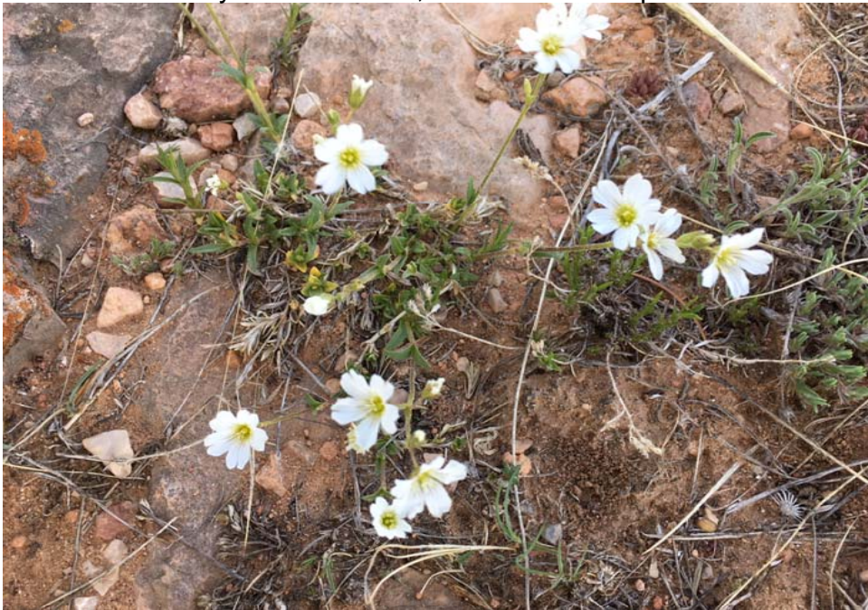
Cerastium arvense , field chickweed