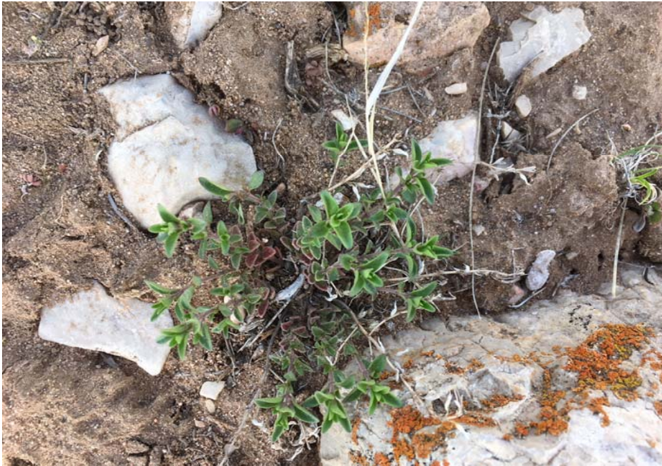
Hedeoma drummondii , Drummond's false pennyroyal