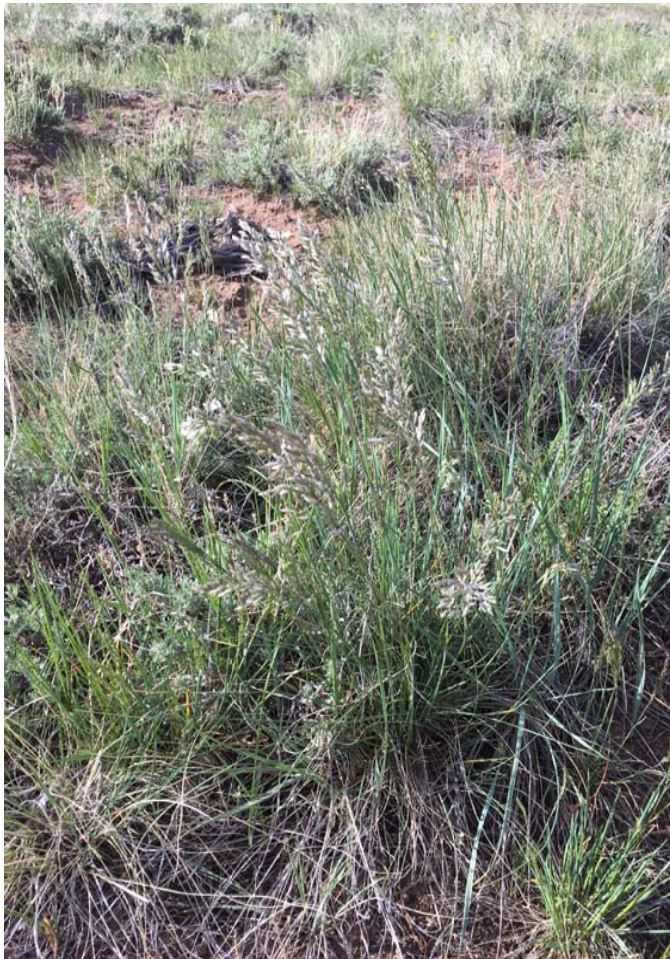
Poa secunda , Sandberg bluegrass