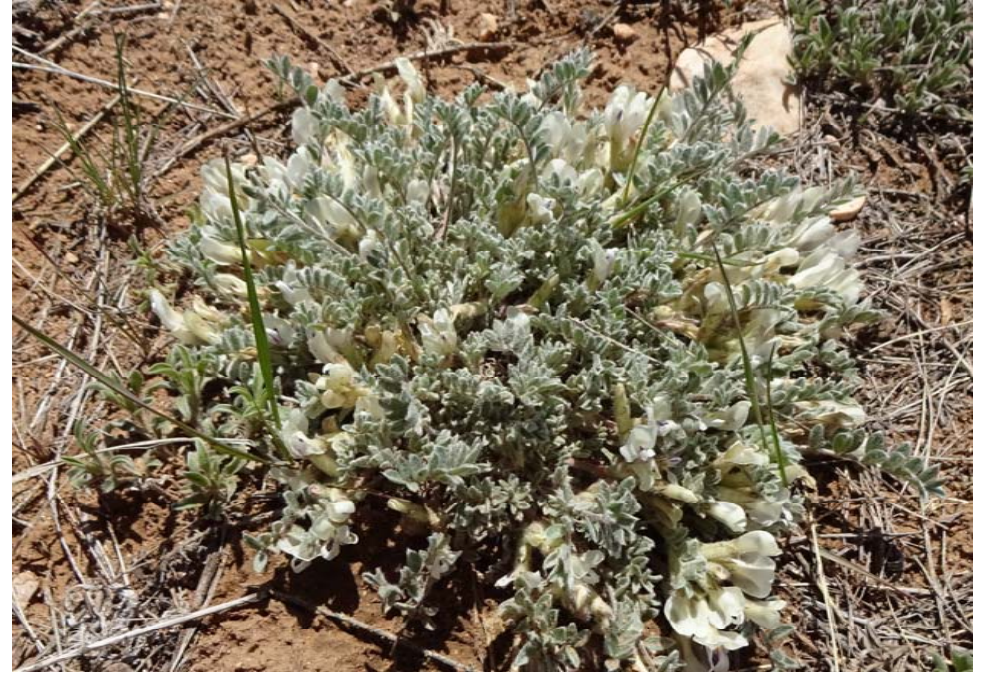
Astragalus purshii , woollypod milkvetch