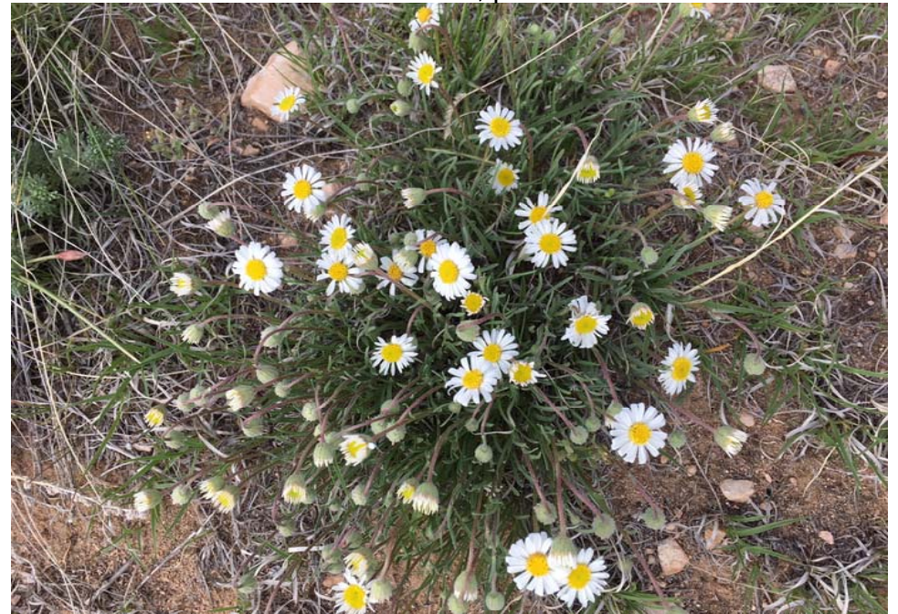
Erigeron engelmannii , Engelmann's fleabane