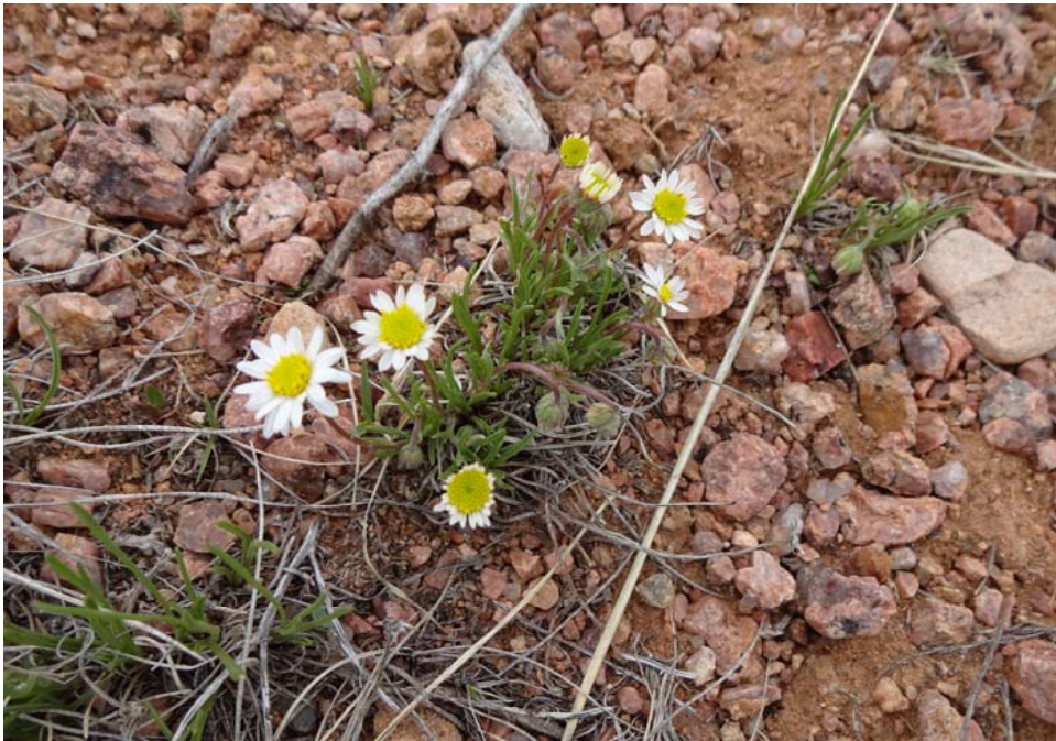
Erigeron sp., Fleabane