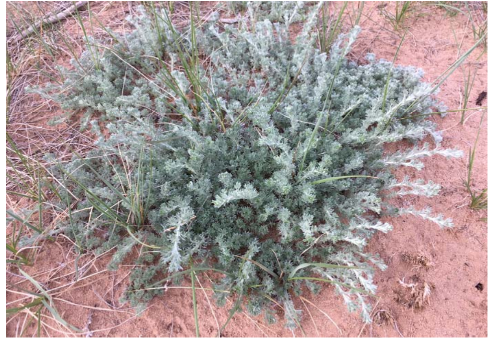
Artemisia frigida , fringed sagebrush