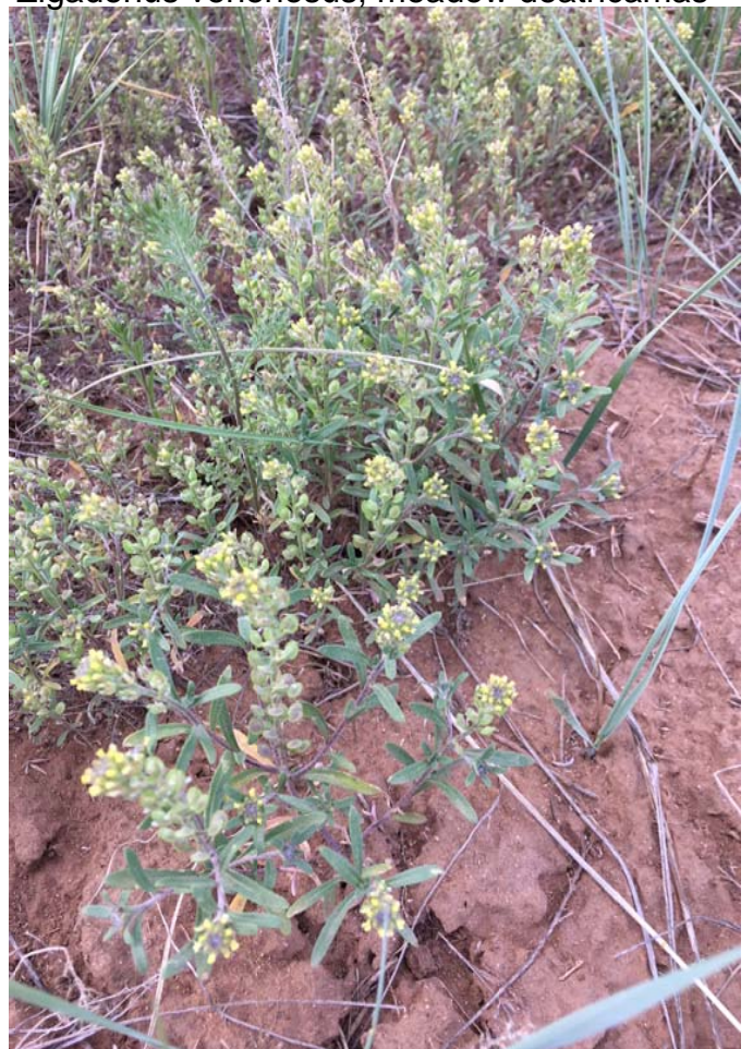
Alyssum desertorum , desert madwort (non-native)