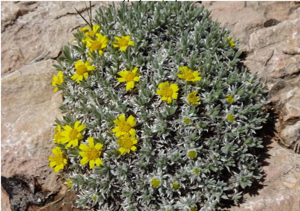
Tetraneuris acaulis var. caespitosa , caespitose fournerve daisy