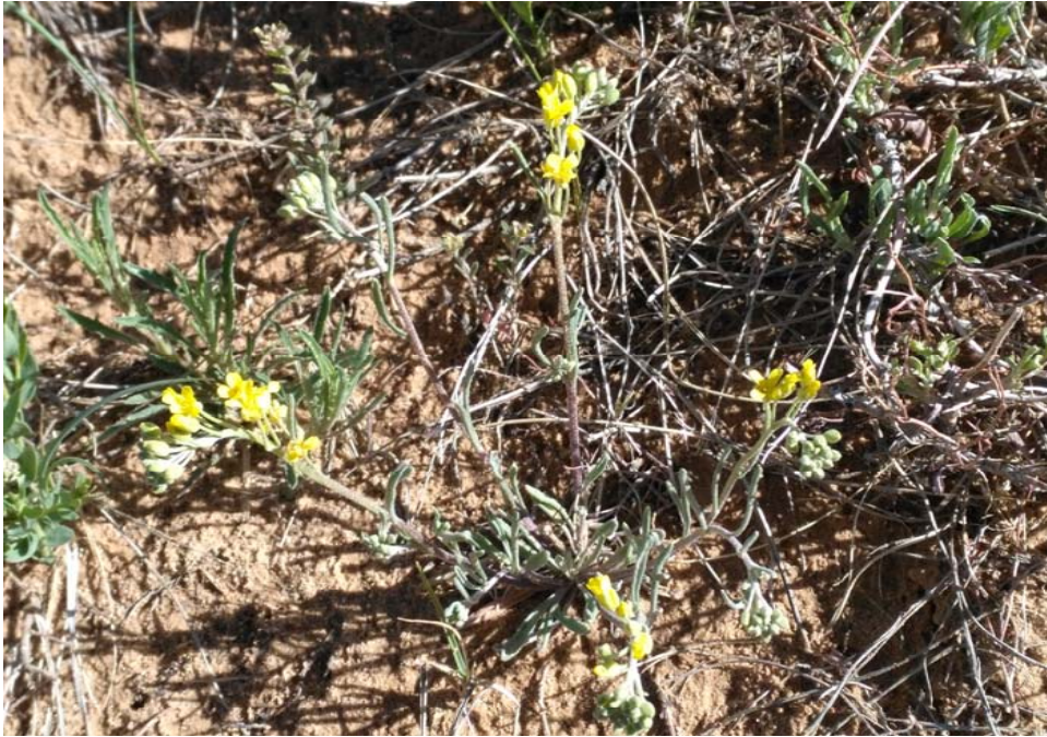
Physaria montana , mountain blatterpod