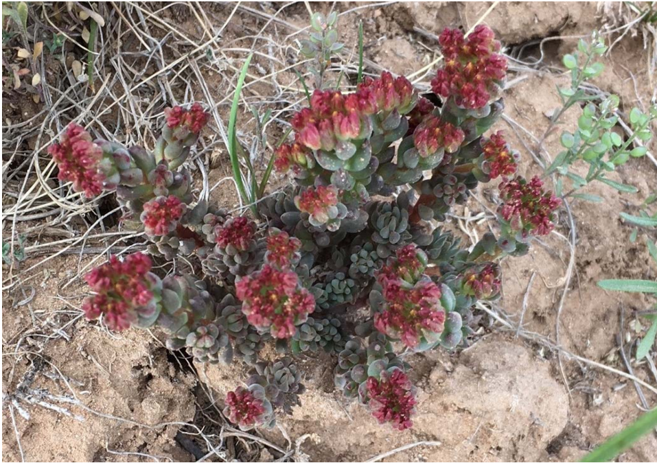
Sedum lanceolatum , spearleaf stonecrop