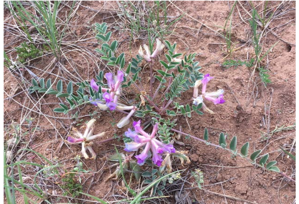
Astragalus shortianus , Short's milkvetch