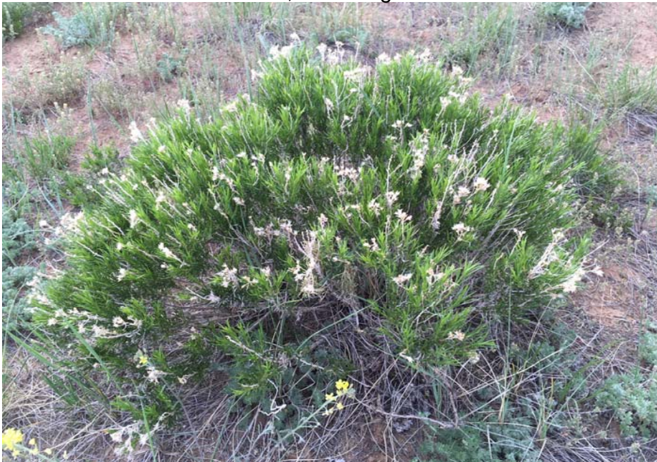
Chrysothamnus viscidiflorus , yellow rabbitbrush