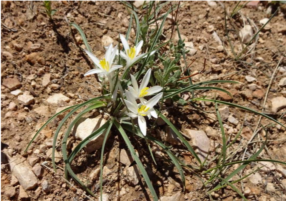
Leucocrinum montanum , common starlily