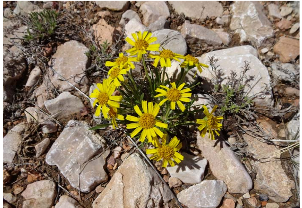
Tetraneuris torreyana , Torrey's four-nerve daisy