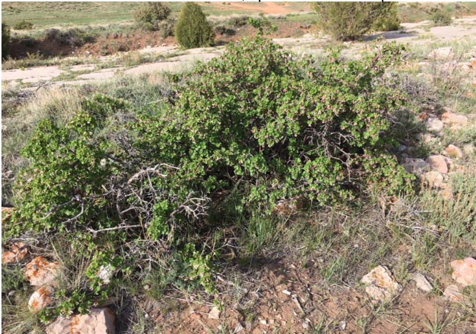
Ribes cereum , wax currant