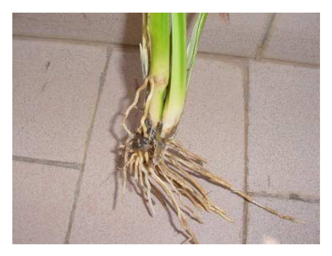
V. zizanioides : growth of new roots on stem 3 months after planting and an accumulation of eroded soil (on the left side of plant)