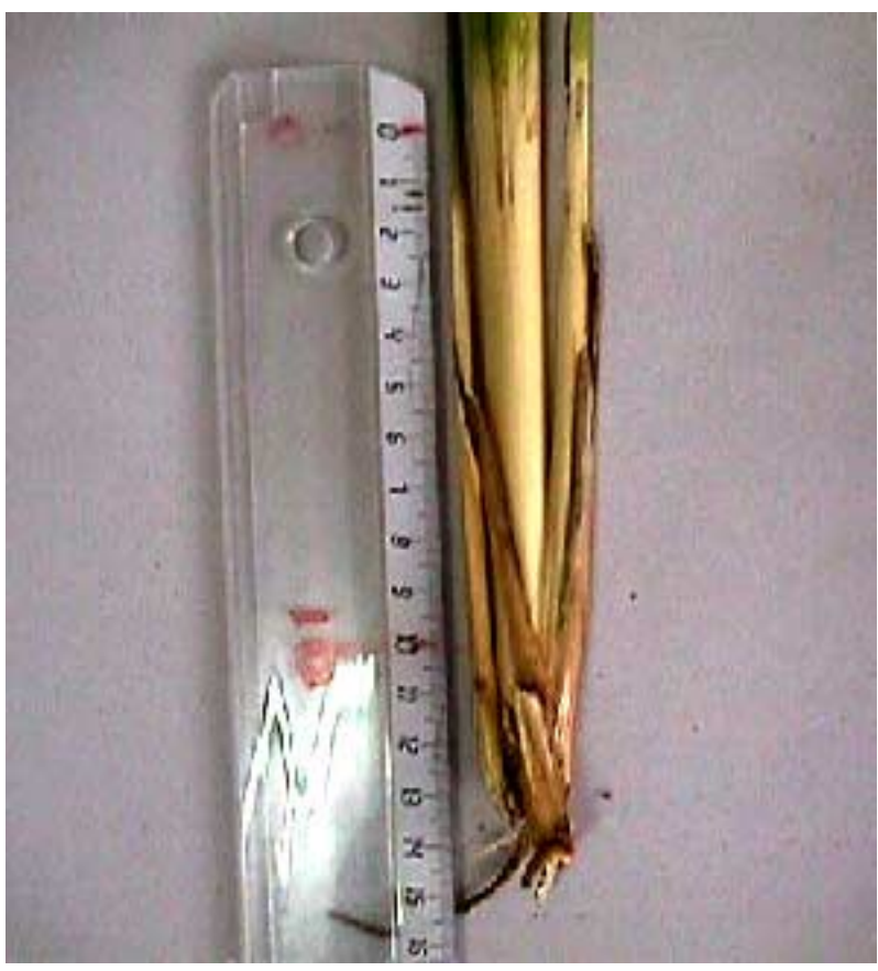
V.nigratana. Root development at base only