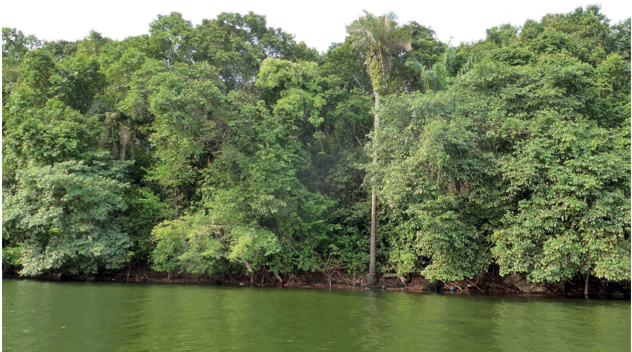
Figure 1 – Forest on a bank of the Kpan Town Lagoon near Libassa Ecolodge and habitat of Englerodendron libassum .

IUCN Conservation assessment (provisional) – Englerodendron libassum is at the moment only known from 5 mature trees. Only one tree is inside the private forest reserve of Libassa Ecolodge. While specimens inside a protected area and those outside of it are usually considered to belong to different locations (threat-defined), this is not the case here, since only one tree occurs inside the reserve. A single mature tree does not make a viable population; it might not even be able to produce seeds without other trees. The protected