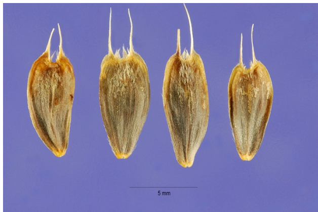
Oneflower helianthella achenes.

Wildland seed is harvested by hand or with racquets into paper sacks or hoppers. The seed can be removed from the flower heads by light threshing or with a hammer mill. Air screens can be used to separate seed from chaff. There are approximately 41,000 seeds/lb (USDA 2012).