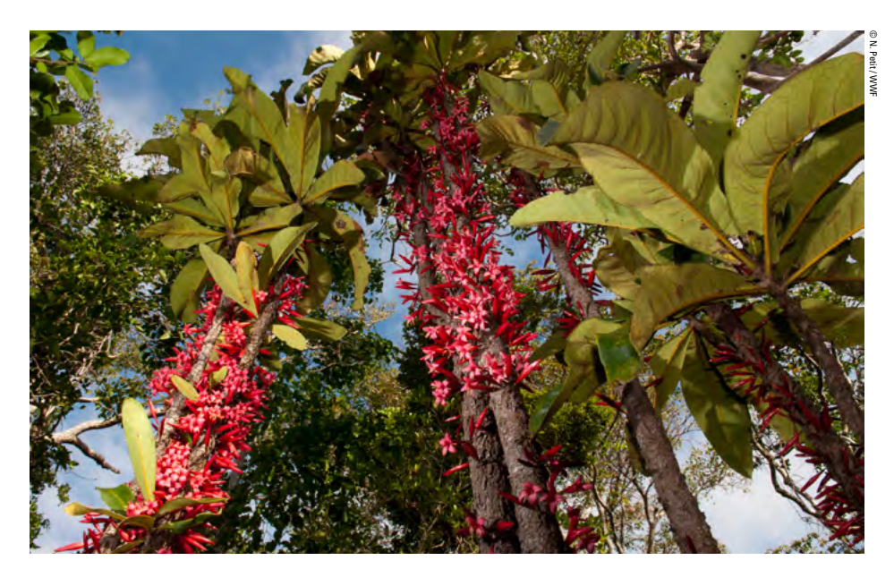
Propagating endemic tree seedlings of endemic species. Here Captaincookia tree ( Ixora margaretae ), an extremely rare tree species saved from extinction by the programme.

The Province Sud changed its environmental code in 2009 to provide regulatory protection of the dry forest via its integration into the environmental code as an ecosystem of heritage importance. Table 3 highlights key results.