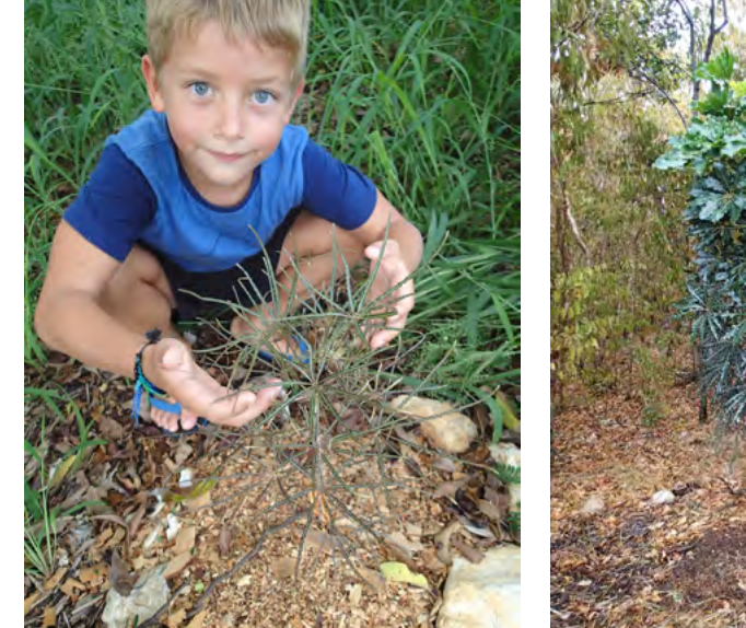
Plerandra (or Schefflera) veitchii is an endemic tree species of New Caledonia. It is vulnerable according to the IUCN Red List due to habitat reduction. Planted in Ouen Toro, Nouméa (enrichment planting) in March 2015 by Elouan, a young volunteer (left), the tree is growing well (>2 m high) two and a half years later, which makes Elouan proud (right).