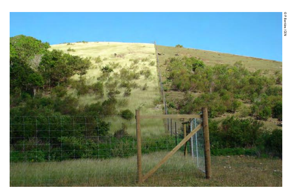
Fence to protect forest from grazing Rusa deer, an invasive species introduced from Indonesia that impedes dry forest regeneration.

A priority has been to develop good pilot examples of restoration on public lands since it is easier to obtain the commitment of public actors because of their active participation in the dry forest partnership initially, and in the CEN more recently. For example,