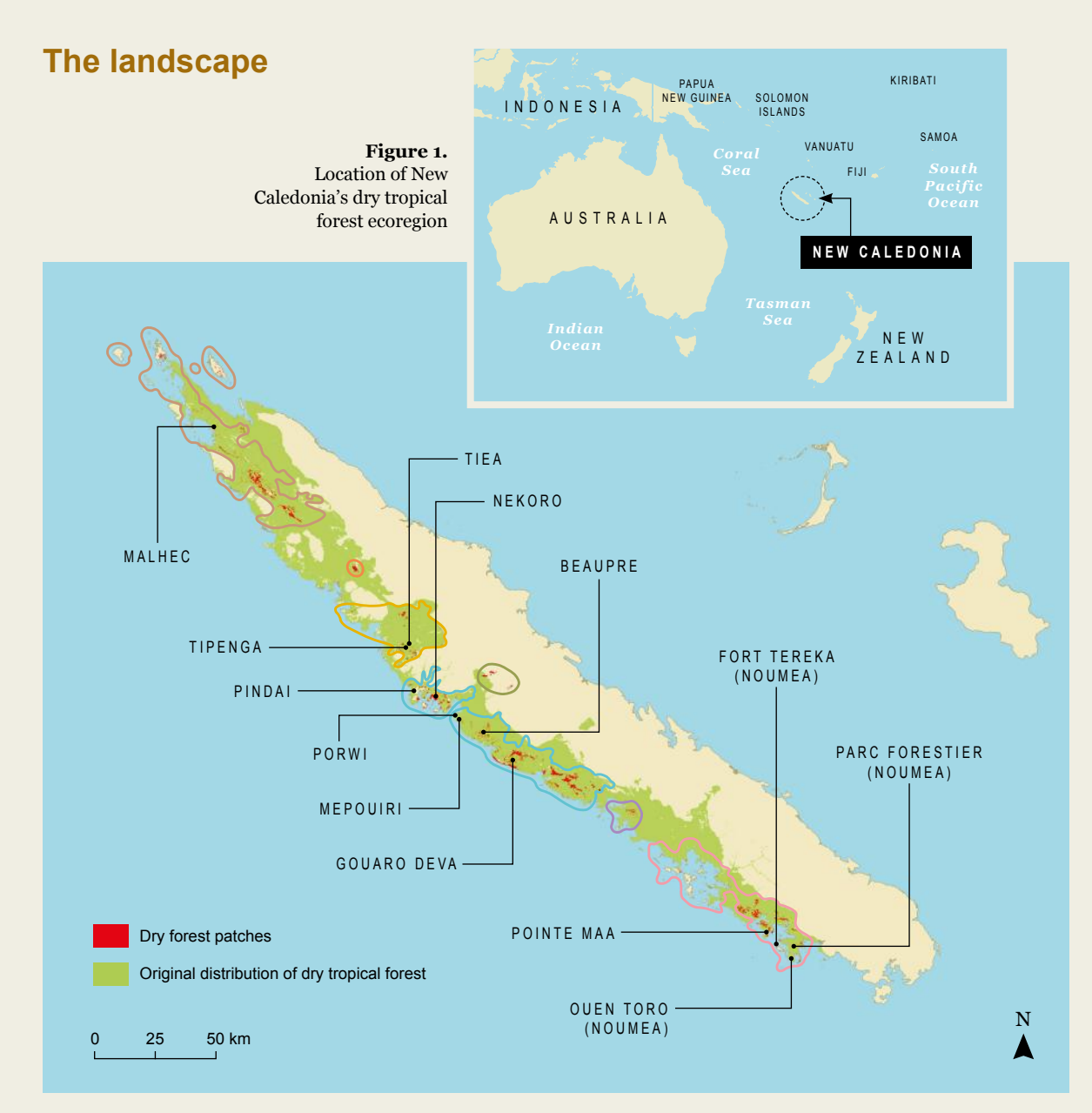
Figure 2. Functional landscape units in New Caledonia's dry forest ecoregion

In terms of forest area, the north zone contains 35.6% of the dry forest, the central zone 27.4% and the south zone 37%. In contrast, the split across identified priority landscapes presents a different picture, with 30.87% occurring in the north zone, 48.45% in the central zone and 20.68% in the south zone. This initial mapping exercise was updated in 2012 (Grange, 2012) and a total of 10 landscapes were identified using the following criteria: altitude, rainfall and geology. A more recent mapping exercise has also taken place (Rota, 2016) which has brought the number of priority landscapes down to seven, but, in part because this new study considers dry forests to be up to an altitude of 500m as per the Province Sud's definition, the total area of remaining dry forest has increased to 17,500ha. Within landscapes, 59 priority sites were identified in 2017 by a working group under the CEN, based on biological criteria, vulnerability and management criteria. Out of these, 22 sites were prioritised for protection and restoration interventions. Rather than seek to significantly expand fragments, priority was given to creating ecologically diverse stepping stones across this highly fragmented landscape.