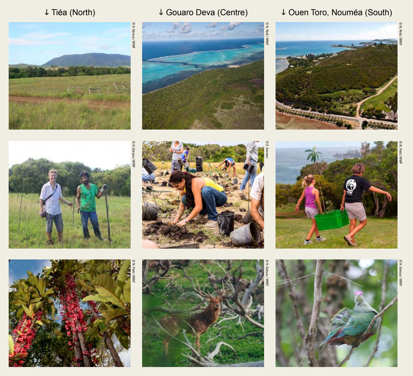
Figure 3. The dry tropical forest landscape in a few images.