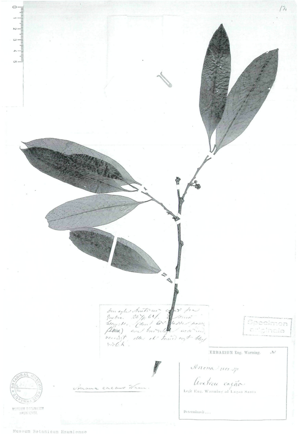
Fig. 1: Lectotype of Annona cacans WARM. (E. Warming s.n. [C])