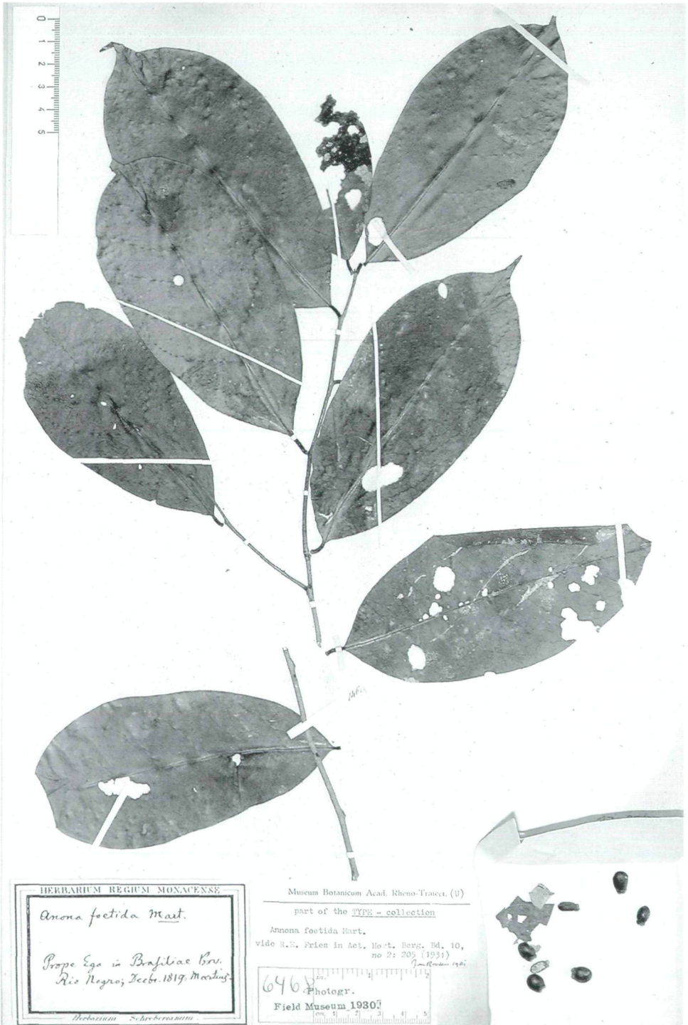
Fig. 3: Lectotype of Annona foetida MART. (C.F.P. von Martius s.n. [M])