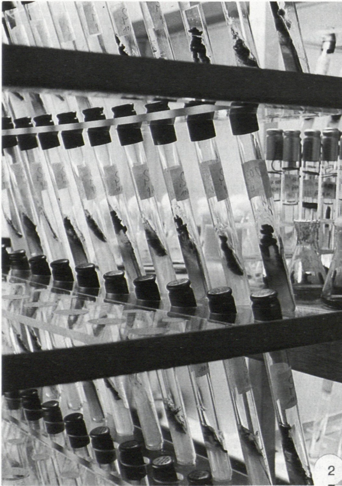
Fig. 2: Shelves made of acryl-glass to enable light diffusion within the racks.