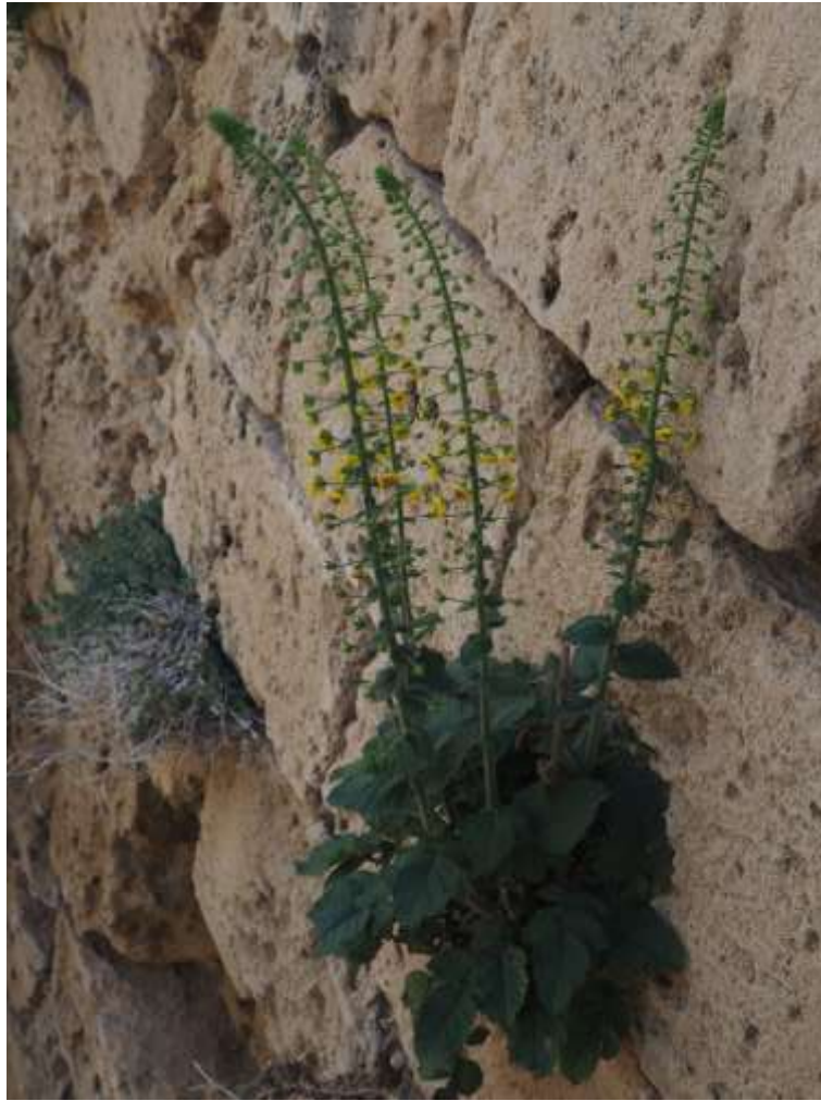
Verbascum levanticum : Kyrénia (Girne). 2019-03-13.