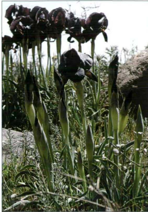
Fig. 16: The Black Iris, Iris nigricans , is the national flower of Jordan. This Iris in addition to about 20 other Iris species are considered.