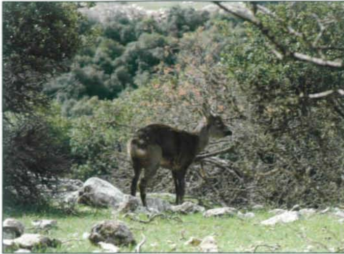
Fig. 10: Introduced roe deer in Ajloun Reserve.