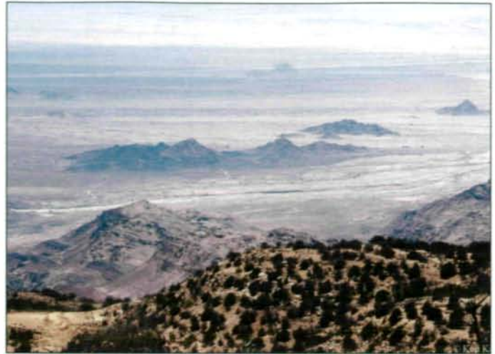
Fig. 9: Landscape showing the Wadi Araba part of Dana Nature Reserve. The mountain series gradually decline to join the Wadi Araba desert.

the Stone Curlew, Pallid swift, Alpine Swift, Rock Thrush, and Ortolan Bunting are migrant birds that can be seen during migration season. The main purpose for this reserve is the breeding of the Nubian Ibex ( Capra ibex ). Several species of carnivores have been recorded such as the hyenas, the caracal, Blanford' fox and the honey badger (ABU BAKER et al. 2004).