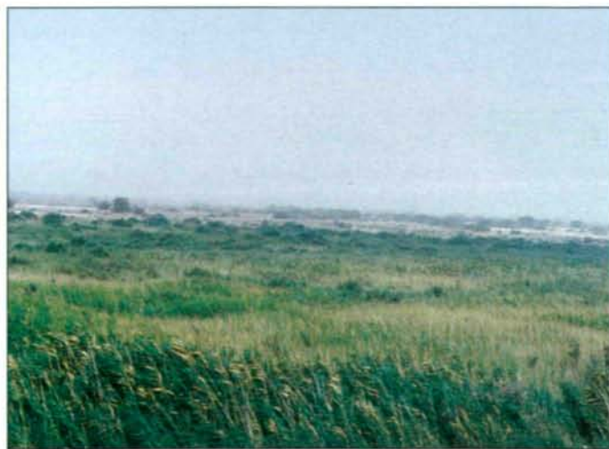
Fig. 5: Landscape of Azraq Wetland Reserve. Thick vegetation of Typha provides a shelter for many birds.