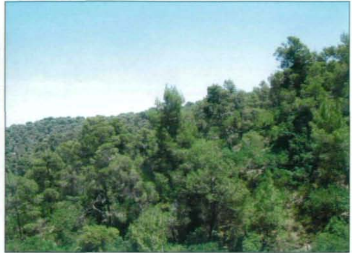
Fig. 15: Thick natural forests of Pinus halepensis in Dibben.

well as to rally support from decision makers. Through the collaboration of the RSCN and the Ministry of Education, over 1000 Nature Preservation Clubs were established in schools all over Jordan. These clubs aim to introduce the value and ethics of respecting nature and to orient the students into nature-loving generation.