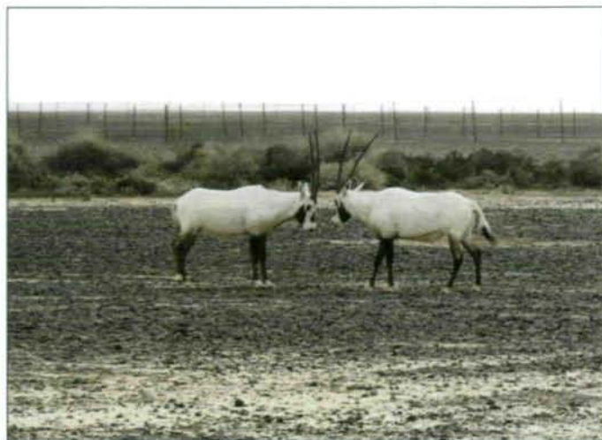
Fig. 3: The Arabian oryx is flourishing in Shumari Reserve after it was introduced in 1978.

Winter visitors include Imperial Eagle, Steppe Buzzard, Cranes, and finches Wheatear. During migration, Lesser Kestrel, Levant Sparrow Hawk, Steppe Buzzard, Red-breasted Flycatcher (autumn), and Cyprus Wheatear were recorded (CLARKE 1980).