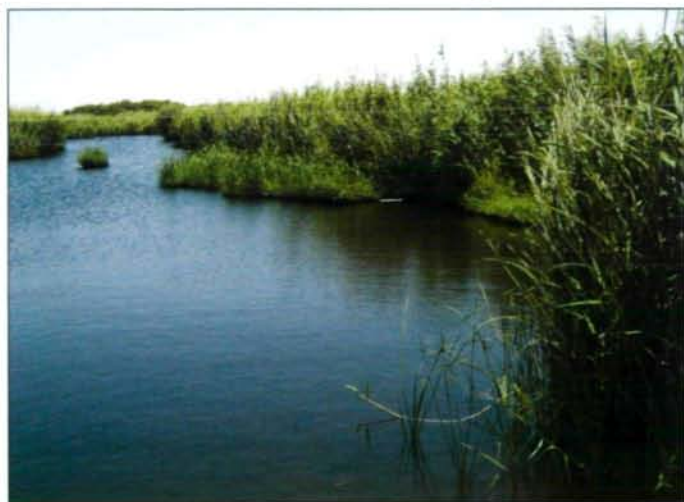
Fig. 4: This is the only wet land reserve in Jordan. Azraq is located on the migratory rout of several birds originating from Europe and Africa.

The main objective of this wetland reserve is to protect migratory birds and conserve wetland habitats. A large number of migrant and wintering wildfowl and waders use the Oasis. Purple Heron, Water rail, Little Ringed Plover, Kentish plover, Marbled Teal, Black winged Stilt, Avocet, Little Tern, Namaqua Dove, and Desert wheatear can be seen irregularly wintering in the Oasis. Other species can be seen wintering or passing through the Oasis such as, Little Grebe, Cormorant, Bittern, Little Bittern,