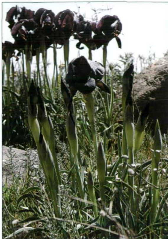
Fig. 16: The Black Iris, Iris nigricans , is the national flower of Jordan. This Iris in addition to about 20 other Iris species are considered.