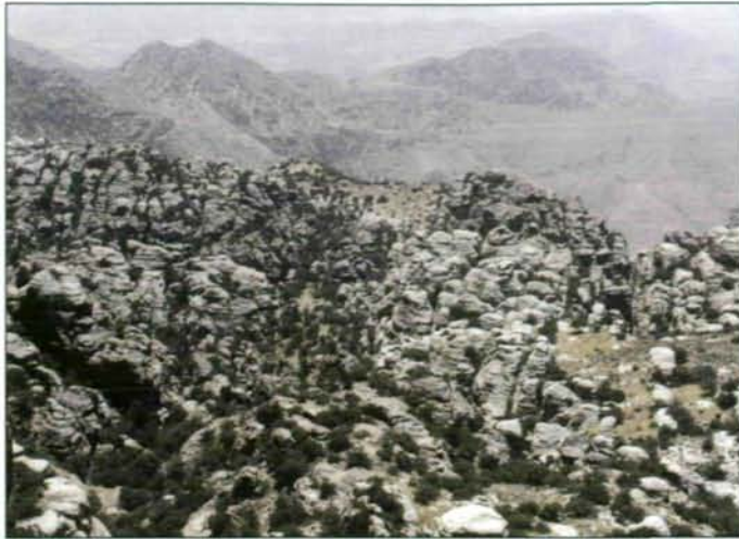
Fig. 8: Forests of juniper in Dana Nature Reserve.