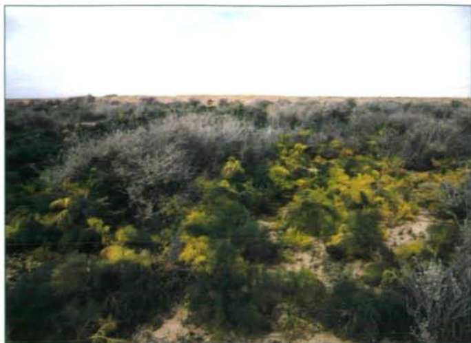
Fig. 2: Landscape of Shaumari Reserve showing the common vegetation of Atriplex .