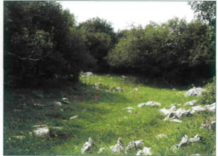
Fig. 11: Spring in Ajloun Nature Reserve. This reserve is thickly covered by ever green oak, Quercus calliprinos .

By far, Dana Nature Reserve is considered the jewel of all nature reserves. It is not only the scenery and nature, but also the great success in implementing socio-economic development and partnership with the locals. This reserve is a model for perfect harmony between people and nature.