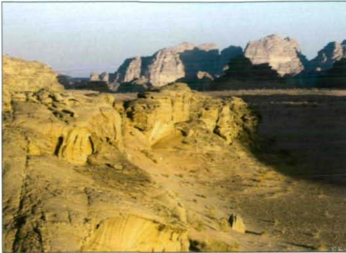
Fig. 12: Landscape of Wadi Rum Protected Area.