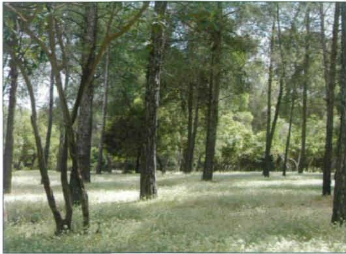
Fig. 14: Forests of pine mixed with oak in Dibben Nature Reserve.