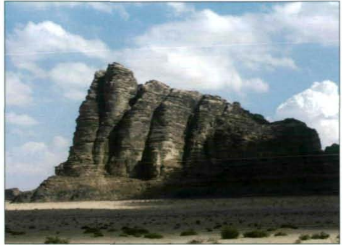
Fig 13: A view in wadi Rum showing the Seven Pillars of Wisdom mountain.

A total of 183 plant species were recorded within the protected area in the baseline flora survey in 1999 and was update in the year 2000. These plants belong to 152 genera and 49 families. The plants were identified as follows: 2 new records to Jordan, 4 ferns, 13 poisonous, 15 rare, 6 endemic, 11 edible, 5 ornamental, 32 medicinal and 57 common species. The two new records are Satureja thymbriifolia and Gagea dayana . BARSOTTI et al. (2000) described the new species, Neurada al-eisawii from Rum. Important flora in the area also includes; Haloxylon salicornicum , Anabasis articulata , Juniperus phoenica and Ficus pseudo-sycomorus .