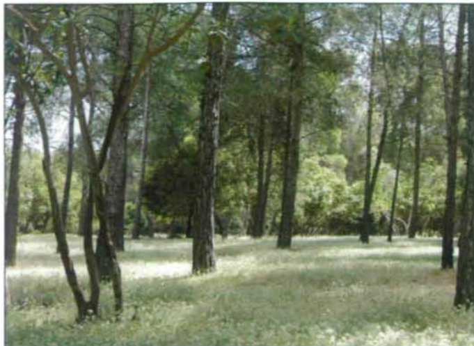
Fig. 14: Forests of pine mixed with oak in Dibben Nature Reserve.