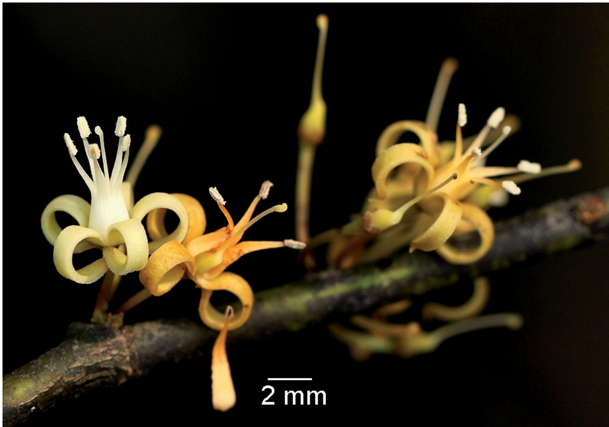
Fig. 3. Rhaphiostylis beninensis (Hook.f. ex Planch.) Planch. ex Benth., like Fig. 2, but also showing ovary and style in older flowers. from Boyekoli Ebale Botany 785 (BR) from Congo Kinshasa.

part of Liberia, and while it is not sure that the species grows in a protected area, “Vulnerable” should be the correct status for the moment (B1 & B2 ab(iii), IUCN 2015).