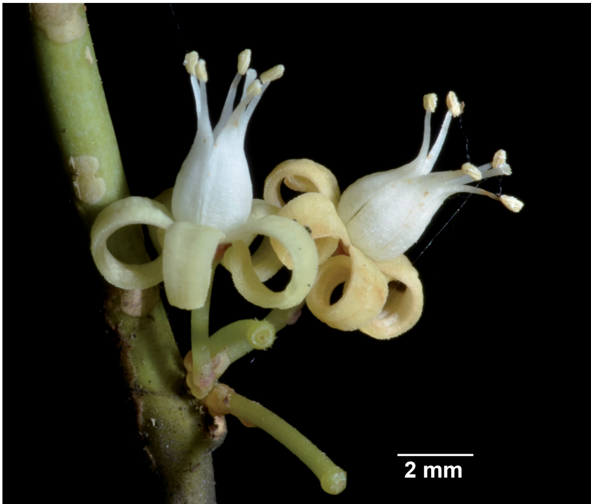
Fig. 2. Rhaphiostylis preussii Engl. showing flowers with the flattened filaments closing around the ovary while the petals are bending down. Photograph by Ehoarn Bidault (Missouri Botanical Garden) from Bidault 786 (MO) from Gabon.