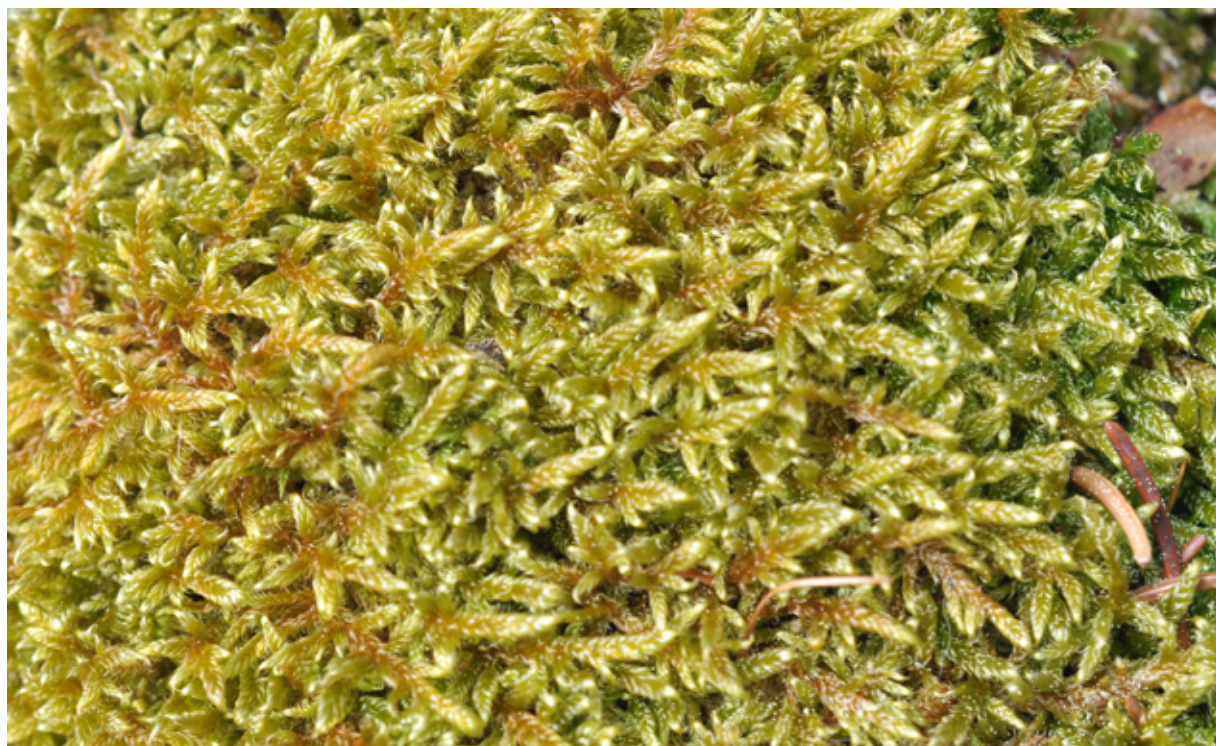
Figure 2. The moss Hypnum cupressiforme , a common species colonizing all the substrates in forests with an optimum growth and diffusion around the 1300 m s.l.m.

The genus Dicranum was dominated by two species ( D. montanum and D. scoparium ) which occupy indifferently all the substrates and altitudes. The other two species, D. brevifolium and D. muehlenbeckii were singletons and are not typical for forest habitats. Identification of D. brevifolium and D. muelenbeckii should be considered tentative, as intermediate forms exists (HEDENÄS & BISANG 2004).