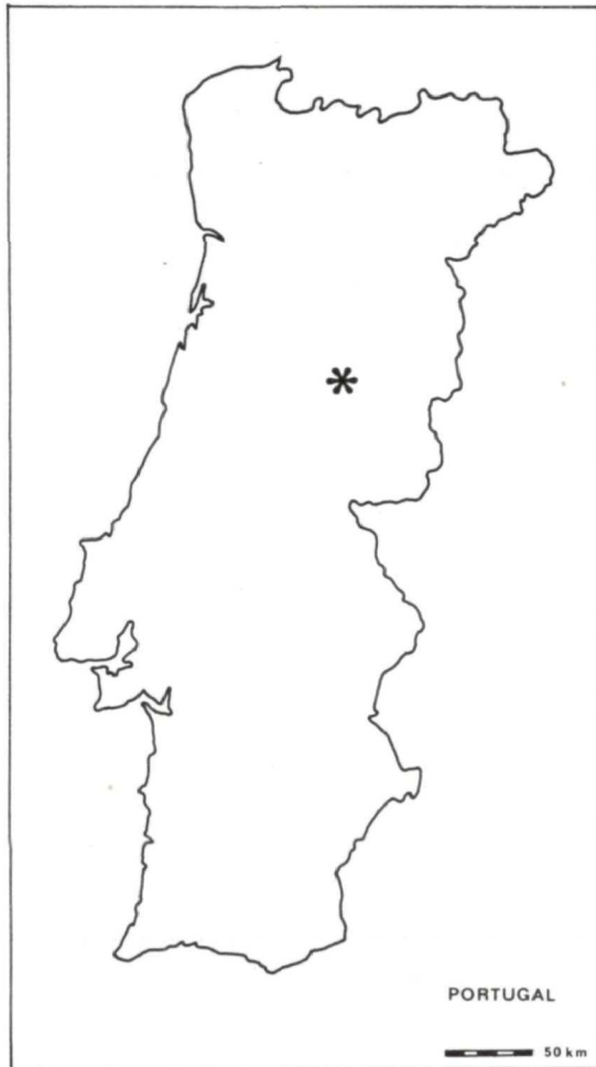
Fig. 1. Location (asterisk) of the study area (Serra da Estrela) in Portugal.

c. 70 km 2 and is delimited by the 1600 m s. m. contour line. It is situated in the southern part of the mountain range, mainly consisting of plateaus with some deep incisions (most of them glacial troughs), all built up by different types of granites mainly being muscovite and two-mica granites (see FERREIRA 1998).