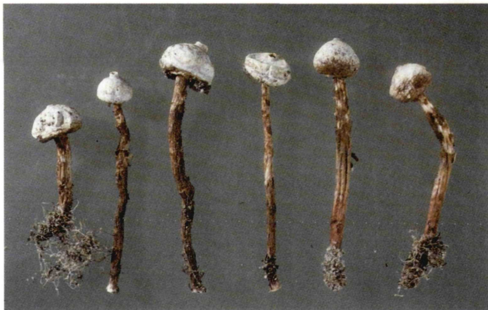
Fig. 3. Tulostoma squamosum , fruitbodies from Ravenna, Italy.