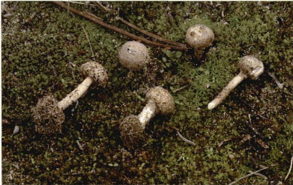
Fig. 2. Tulostoma lesiei , fruitbodies from Ravenna, Italy.