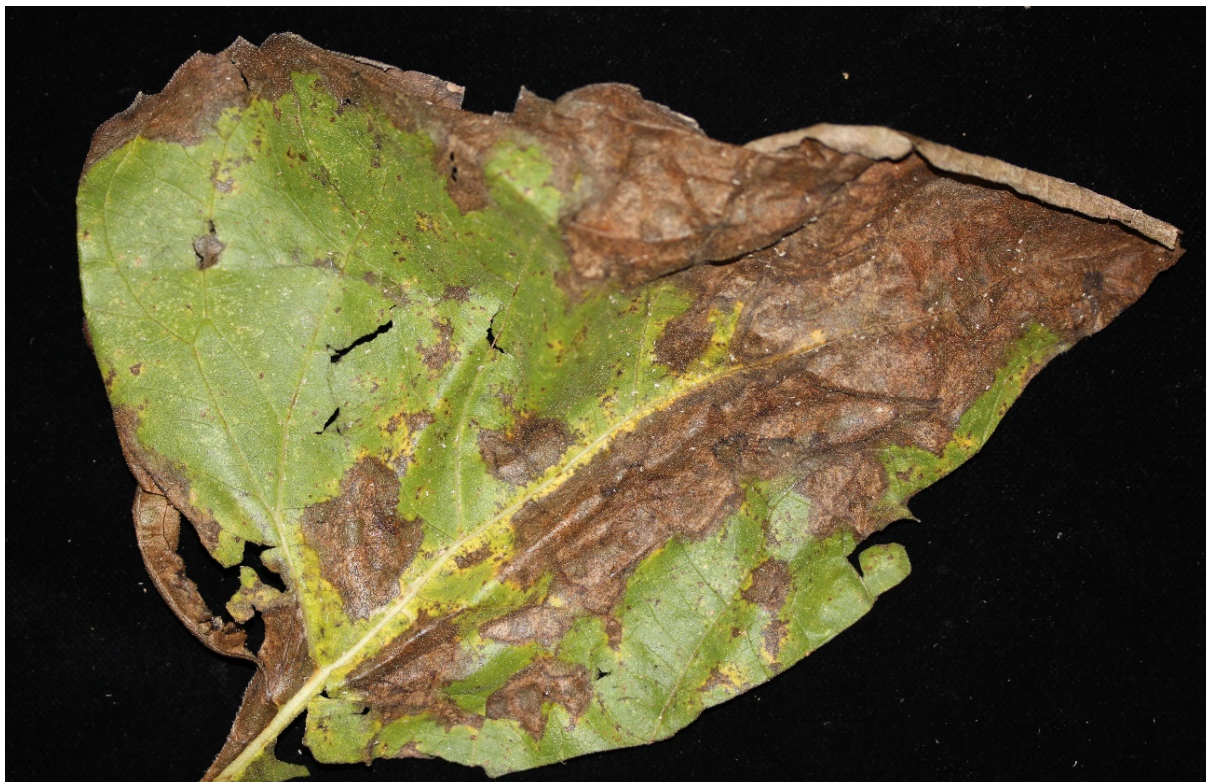
Fig. 1. Multiple infection symptoms of Septoria helianthina and Cercospora helianthicola on a leaf of Helianthus annuus .

cells are hyaline and pyriform. Based on the microscopical characteristics this species was identified as Septoria helianthina (Tab. 1).