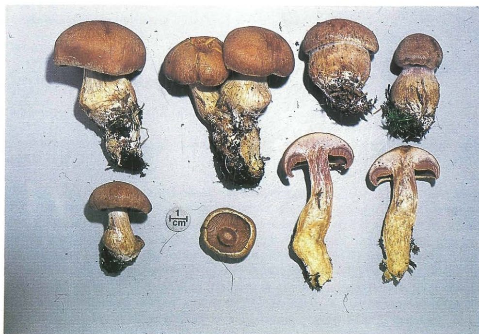
Colour fig. III. Cortinarius largodelibutus (IB 94/282). Colour fig. IV. Cortinarius variipes var. janthinophyllus (IB 94/287, holotypus).