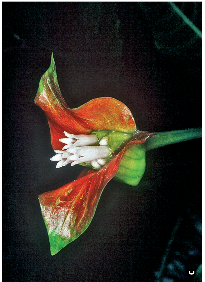
Plate 1: (a) Carapichea affinis (syn. Psychotria borucana ), (b) Psychotria elata , (c) Psychotria chiapensis , (d) Notopleura uliginosa (syn. Psychotria uliginosa )