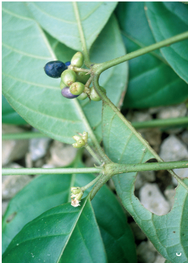
Plate 2: (a) Faramea suerrensis , (b) Notopleura polyphlebia (syn. Psychotria polyphlebia ), (c) Ronabea latifolia (syn. Psychotria erecta ), (d) Sabicea panamensis