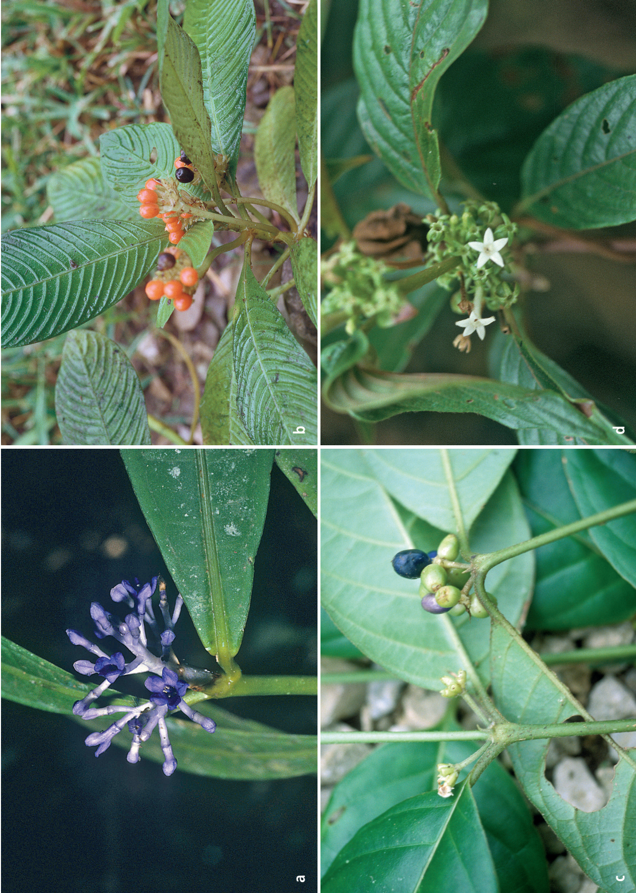
Plate 2: (a) Faramea suerrensis , (b) Notopleura polyphlebia (syn. Psychotria polyphlebia ), (c) Ronabea latifolia (syn. Psychotria erecta ), (d) Sabicea panamensis