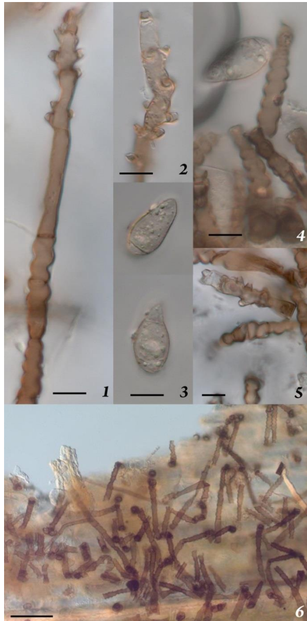
Figs 1–6: Pyricularia contorta . 1. Conidiophore. 2. Conidiogenous cell. 3. Conidia. 4–5. Fragments of conidiophores. 6. Colony with scattered conidiophores. Bars – 10 \mu m (1–5), 50 \mu m (6).