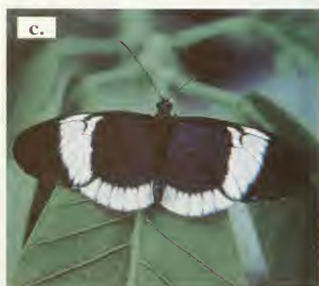
Figure 1: a: Flowers of Passiflora tina R.Boender & T.Ulmer grouped in dense fascicles (Boender 744, cultivated); b: Flower, close up showing the corona series; c: Heliconius sapho candidus Brown.