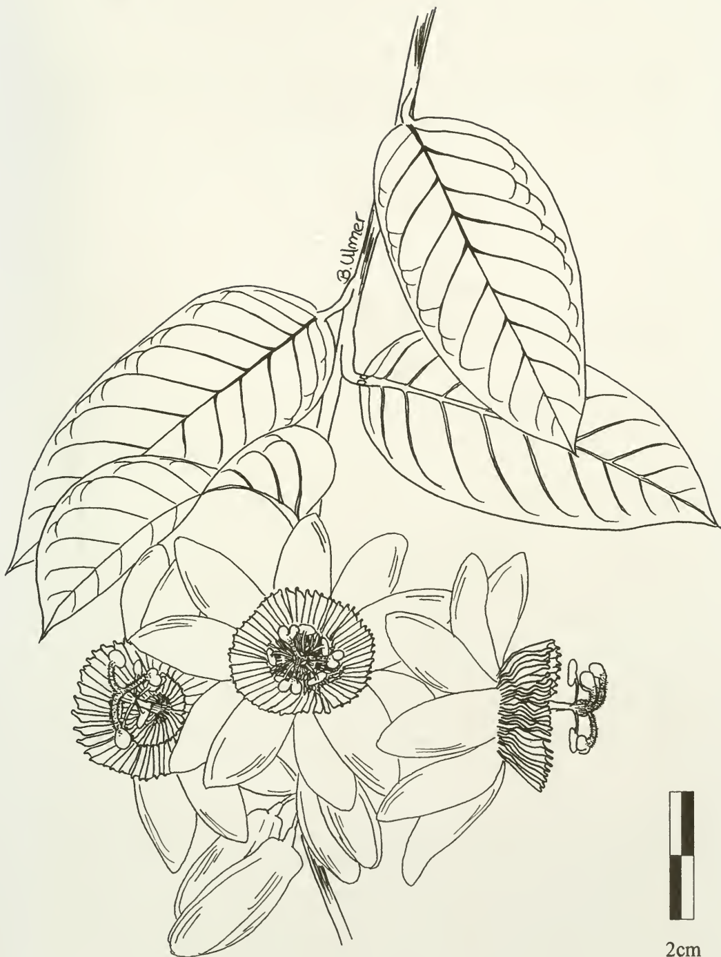
Figure 2: Habit of Passiflora tina .