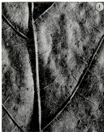
Fig. 1. Millettia auriculata leaf showing rust sori, ca. \times 4 .

with unaided eye; teliospores hyaline to pale-brown, cylindrical, clavate to fusiform with attenuated apex, sessile, borne on basal cells singly or in groups of 2—4 spores on each cell, produced in succession so that the young spores push the older ones to one side as they develop, laterally free, 30-60 \times 11-17 \mu ; basal cells hyaline, branched, sometimes discharged along with teliospores giving the stalked appearance. Teliospores germinate immediately by prolongation of apex to give rise 4-celled promycelium bearing 4 stout sterigmata, each bearing a basidio-