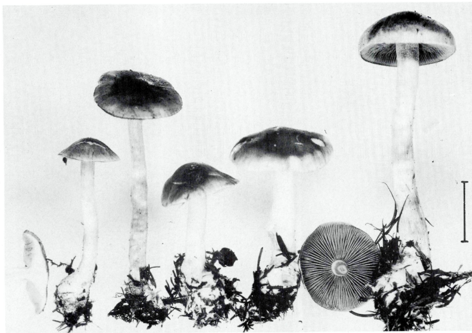
Fig. 3: Hebeloma incarnatum , Sm-33-1129. (bar = 2 cm).