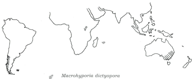
Fig. 2 - Distributional area of Macrohyporia dictyopora (CKE.) JOHANS. & RYV.

Postia pelliculosa has also been recorded from Tasmania and Rwanda.