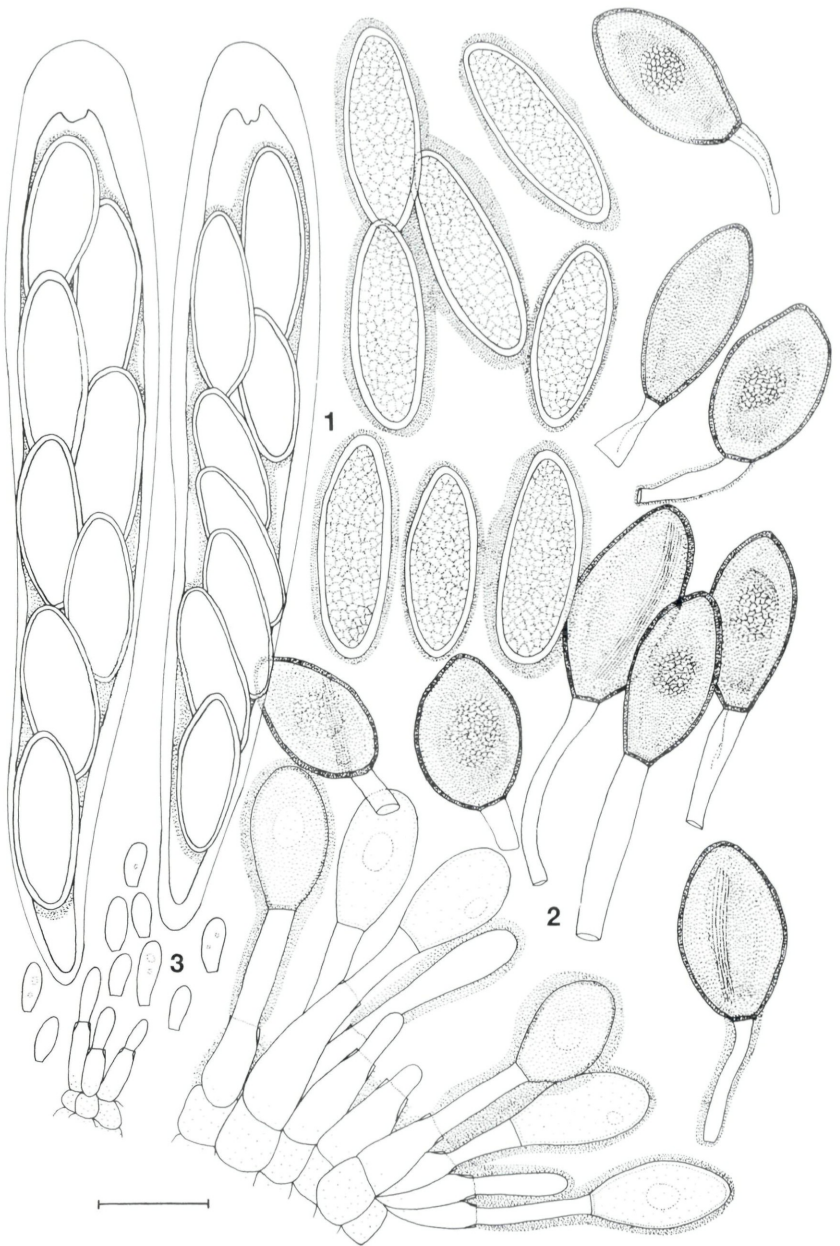
Figs. 1–3. – Wuestneia molokaiensis and its Harknessia molokaiensis anamorph (holotype). – 1. Asci and ascospores. – 2. Conidia and conidiophores. – 3. Microconidia and conidiogenous cells. – Bar = 10 \mu m.