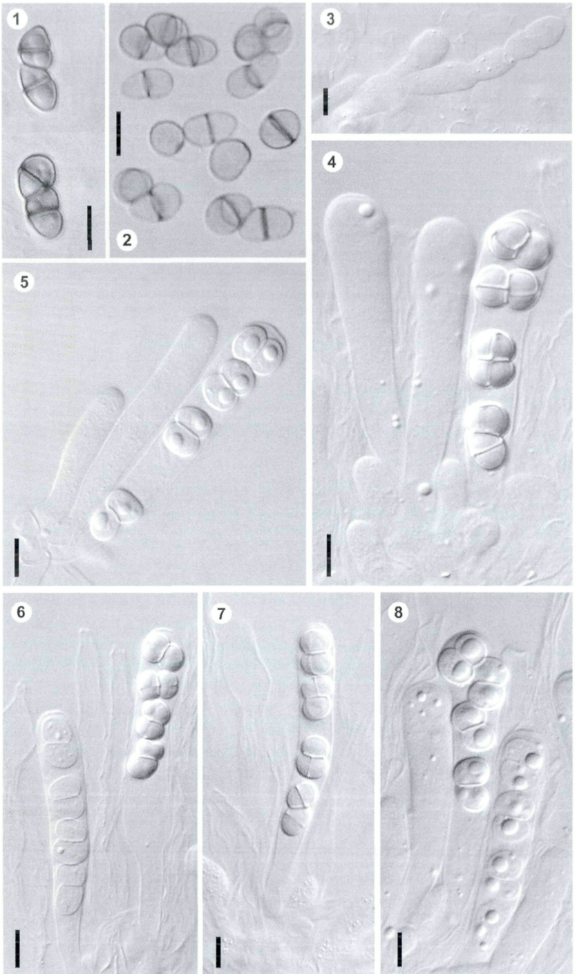
Figs. 1–8. Synaptospora olandica . – 1, 2. Mature ascospores. – 3. Paraphyses. – 4, 7. Asci containing mature ascospores. – 5, 6, 8. Asci containing young ascospores. – Scale bar = 5 \mu m. – Figs. 1–8 from PRM 896153 (HOLOTYPE).