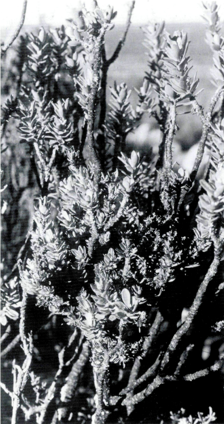
Fig. 1. Witches' broom caused by Uromyces euryopsidicola on Euryops empetrifolius .