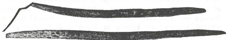
Fig. 1. „ Dematiaceae capsularum “ on capsules of Catalpa . Orig. \times \frac{1}{2} .