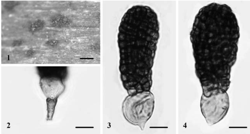
Figs. 1-4. Berkleasmium zhejiangense (holotype). 1. Sporodochia on natural substrate (bar = 200 \mu\text{m} ). 2. Conidiophore, conidiogenous cell and immature subtending cell (bar = 10 \mu\text{m} ). 3-4. Conidia with a thin-walled, pale brown to brown subtending cell (bar = 10 \mu\text{m} ).

lor & Hyde 2003, Zhao & Zhang 2004, Pinnoi et al. 2007, McKenzie 2008). Ribosomal DNA phylogenies reveal that Berkleasmium is not monophyletic and is closely related to the family Sporormiaceae Munk in order Pleosporales Luttr. ex M.E. Barr (Pinnoi et al. 2007).