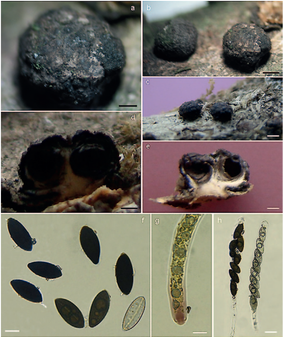
Fig. 1. Xylaria fanjingensis , holotype. a-c. Stromata. d, e. Vertical section of stroma. f. Ascospores and germ slits. g. Ascus apical ring. h. Ascus and ascospores. Scale bars: a, d, e 0.5 mm, b, c 1 mm, f, g 15 \mu m, h 30 \mu m.