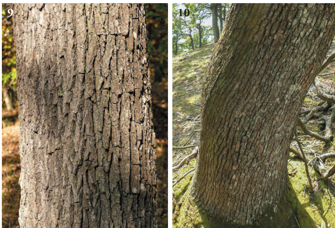
Figure 9. Bark of the old Q. iberica tree (Appendix 1: 11B; Fig. 7), 21. 10. 2019.