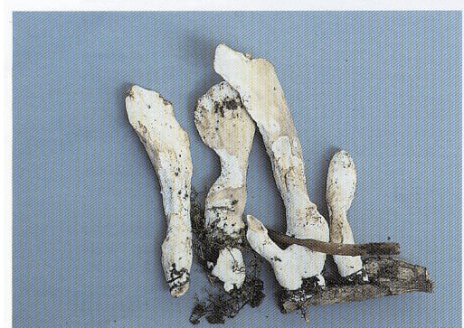
Fig. 10. This undescribed Dichopleuopus -like fungus lacks dichophyses which help characterize the genus Dichopleuopus .