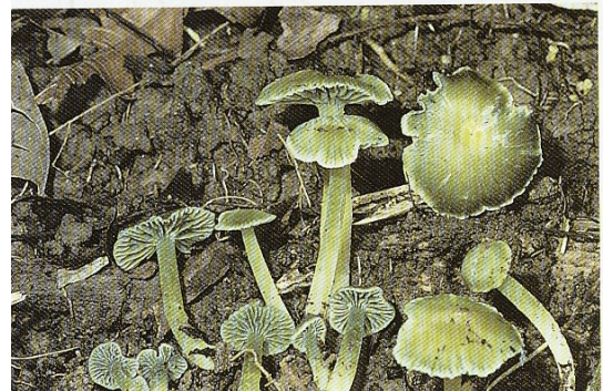
Fig. 4. This undescribed green species of Hygrocybe in Sect. Coccineae was collected in the Central Mountain Range of Puerto Rico.

The highest diversity and percentages of undescribed species are among the agaric fungi, especially in the families Amanitaceae (Miller et al. , 2000; Miller & Lodge, in press), Tricholomataceae, Entolomataceae (Baroni & Lodge, 1998) and Hygrophoraceae (Cantrell & Lodge, 2000, 2001). One of the more intriguing finds is a new species of Callistodermatium Fig 2, a previously monotypic genus described from South America. This new species has been collected in the mountain ranges of Puerto Rico and the Dominican Republic. The genus is characterized by having pileus pigments that turn purple to violet in alkaline solutions, and is thought to be related to Cyptotrama asprata (Berk.) Redhead & Ginns.