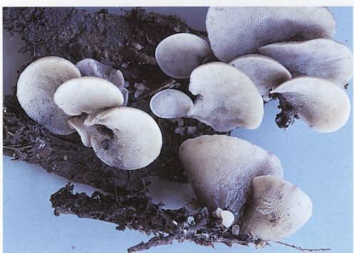
Fig. 9. This unknown species has a completely gelatinized trama in the pileus and tubes, and has tubes up to 1 cm in length. Analysis of molecular sequences and micromorphology indicate this should be placed in the genus Resupinatus , which typically has lamellate basidiomes.