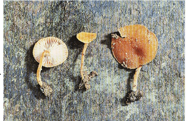
Fig. 3. An unusual new species in Sect. Firmae , Hygrocybe brunneosquamosa Lodge & S. A. Cantrell, from the Luquillo Mountains of Puerto Rico.