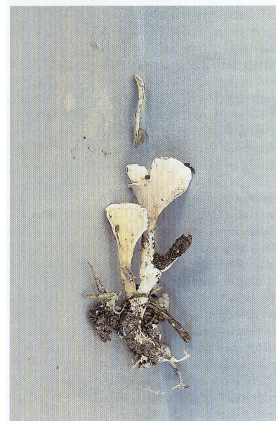
Fig. 12. This species represents a group which, although resembling the Dichopleuopus -like fungus in Fig. 10, does not appear to be closely related to any known basidiomycetes, according to DNA analyses. (Collected in the Dominican Republic; photo by D. J. Lodge.)

It is clear from the results of the Basidiomycetes of the Greater Antilles project so far that the Caribbean has a great diversity of basidiomycete fungi. Furthermore, many of these fungi appear to be restricted to the region, and some are only known from a single island or group of islands. Some of the recently discovered fungi are stretching the limits of known genera, a few are contributing to Vilgalys & Moncalvo's project to restructure the Agaricales using molecular analyses, while others apparently represent new genera, families, and possibly a new order.