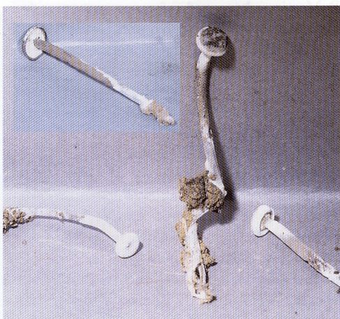
Fig. 11. This fungus, referred to as the 'nail-head fungus' for lack of another name, apparently belongs to the genus Arthrosporella in the Tricholomataceae.