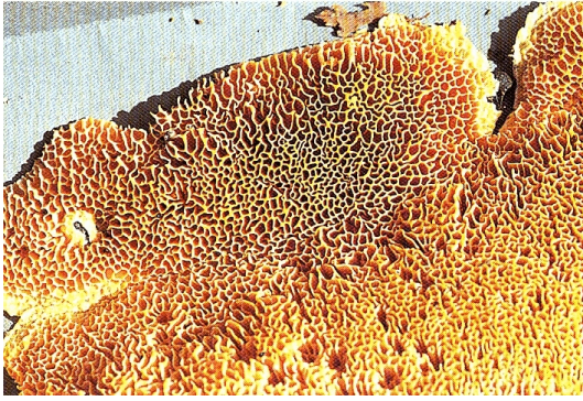
Fig. 1. A new resupinate species of Antrodia on pine logs from the Central Mountain Range of the Dominican Republic. It has deep orange, sinuous pores that are larger and more irregular than those of A. radiculosa .