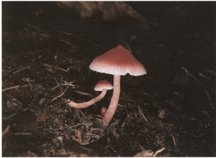
Fig. 5. This striking new rose-wine colored Humidicutis has been found several times in the Luquillo Mountains of Puerto Rico, and is the first reported species of Humidicutis in the Caribbean.

undescribed taxa, exceeding our prediction of ten new species. Seven of the 17 new species are in Section Firmae , a tropical group characterized by two sizes of spores and basidia on the same basidiome. One of our new species in this group, H. brunneosquamosa Lodge & S. A. Cantrell (Fig 3), is very unusual in this section for having dull brown rather than bright colors and a squamulose pileus (Cantrell & Lodge, 2001). Most species in Section Firmae are brightly colored (yellow, orange, red, purple or green), and have a silky-fibrillose, subviscid or viscid surface (Cantrell & Lodge, 2001). Two additional new species of Hygrophoraceae with unusual colors are shown in Figs 4 and 5. Species with green basidiomes are rare, such as the undescribed species of Hygrocybe in Section Coccineae (Fig 4). A new species with a conic rose-wine colored pileus shown in Fig 5 (see front cover)