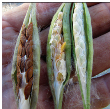
Top: Milkweeds used along a Michigan roadside in a habitat restoration planting. Bottom, from left to right: Swamp milkweed ( A. incarnata) flowers with green sweat bee ; Spider milkweed ( A. asperula) fruits (pods) ; Open narrow-leaved milkweed ( A. fascicularis) pods showing seeds and floss.