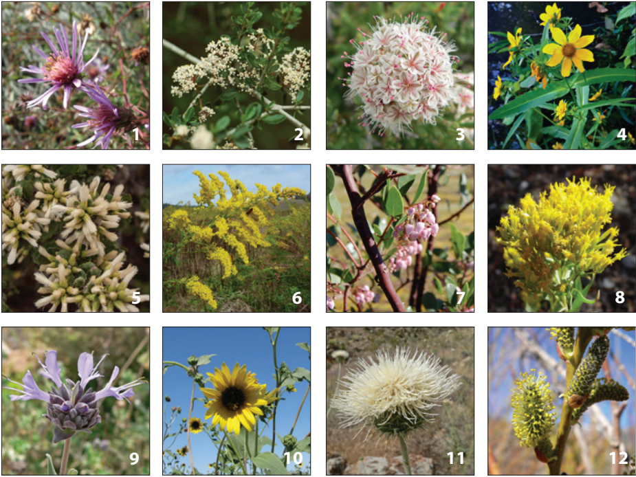
Photos: 1. Aster (Matthew Shepherd, The Xerces Society); 2. Buckbrush (Franz Xaver, Wikimedia Commons); 3. Buckwheat (Stan Shebs, Wikimedia Commons); 4. Bur marigold (Fritz Flohr Reynolds, Wikimedia Commons); 5. Coyote bush (Franco Folini, Wikimedia Commons); 6. Goldenrod (Stan Shebs, Wikimedia Commons); 7. Manzanita (USDA Lockeford Plant Materials Center); 8. Rabbitbrush (Wallace Keck, Wikimedia Commons); 9. Sage (Stan Shebs, Wikimedia Commons); 10. Sunflower (Jennifer Hopwood, The Xerces Society); 11. Thistle (Stan Shebs, Wikimedia Commons); 12. Willow (Stan Shebs, Wikimedia Commons).