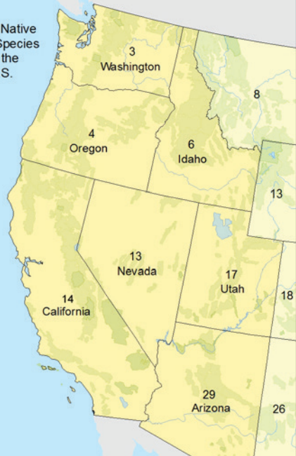
Figure 3: Number of native milkweeds by state.