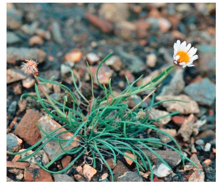
Buff Fleabane, Erigeron ochroleucus