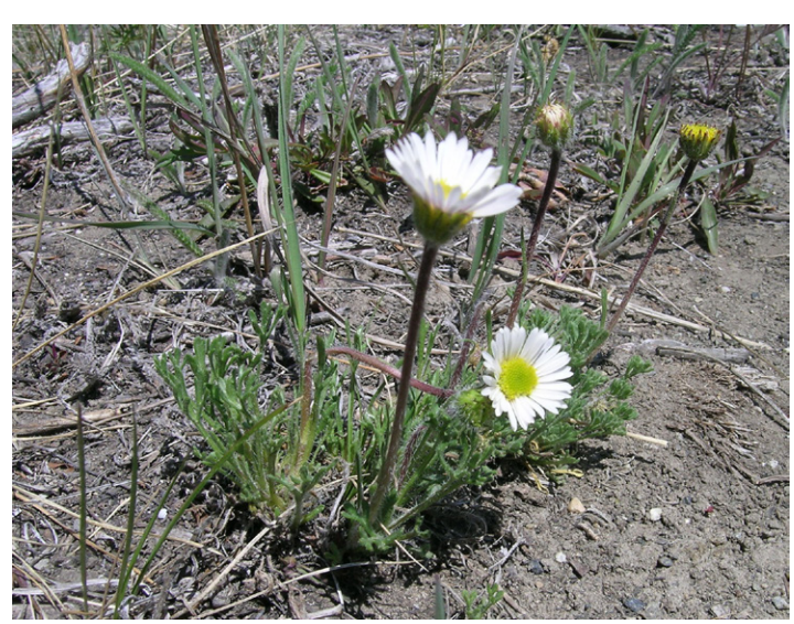
Cut-leaved Fleabane ( Erigeron compositus ) *see distinguishing features.