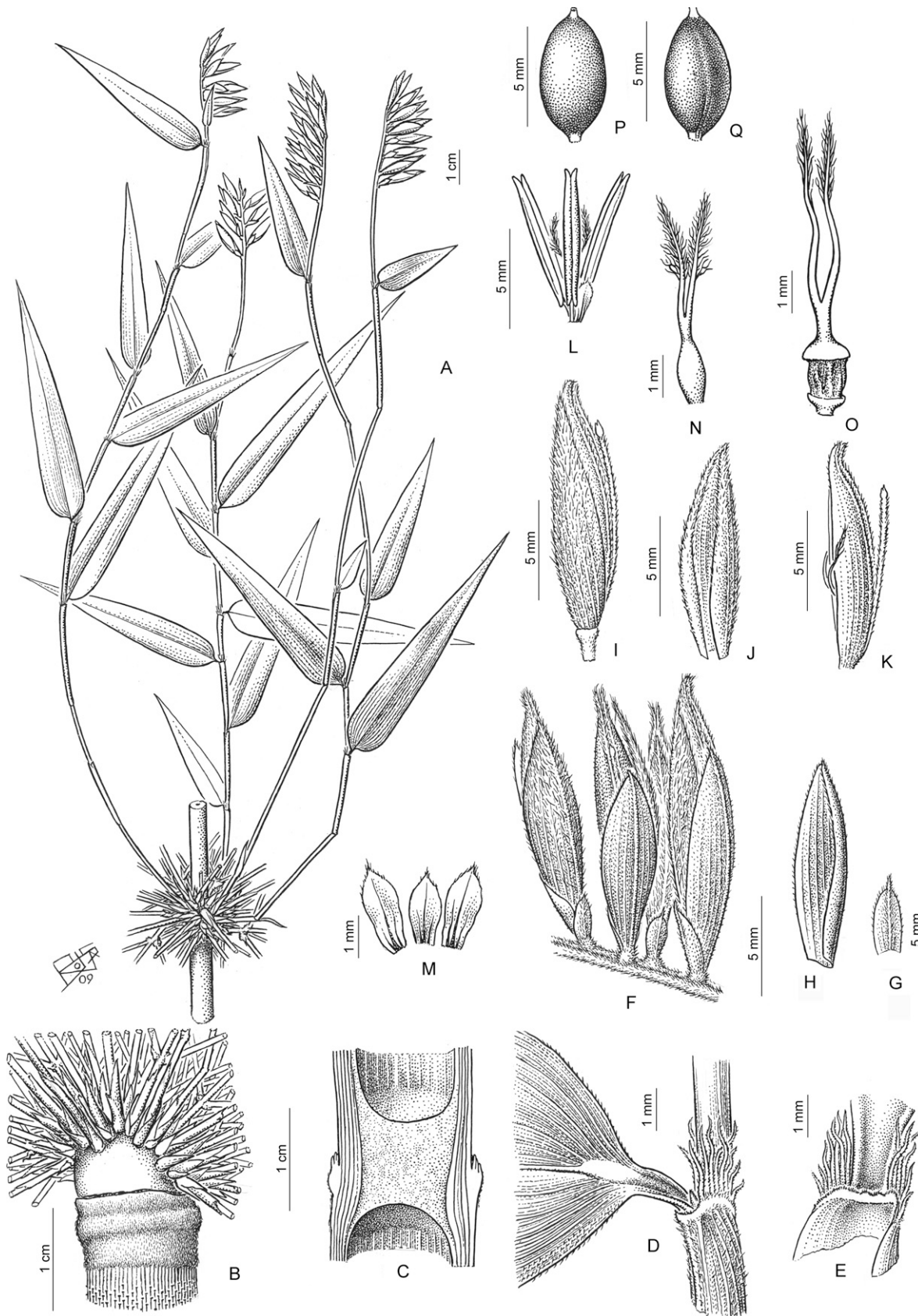
FIG. 2. Merostachys multiramea . A. Flowering branches and part of branch complement. B. Base of the branch complement. C. Node in longitudinal section, internal view. D. Upper portion of the branch foliage leaf sheath, ligule, oral setae, pseudopetiole, and blade (adaxial surface). E. Inner ligule and oral setae, ventral view. F. Rachis fragment provided with spikelets. G. Lower glume, ventral view. H. Upper glume, dorsal view. I. Spikelet, glumes removed. J. Lemma, ventral view. K. Palea and rachilla prolonged in a reduced floret, lateral view. L. Lodicule, androecium, and gynoecium. M. Lodicules, detail. N. Gynoecium. O. Immature caryopsis. P. Caryopsis, dorsal view. Q. Caryopsis, hilar view. [A, D-K, O-Q from Mulgura de Romero et al. 2713 (SI); B-C, L-N from Porta 33 (SI)].