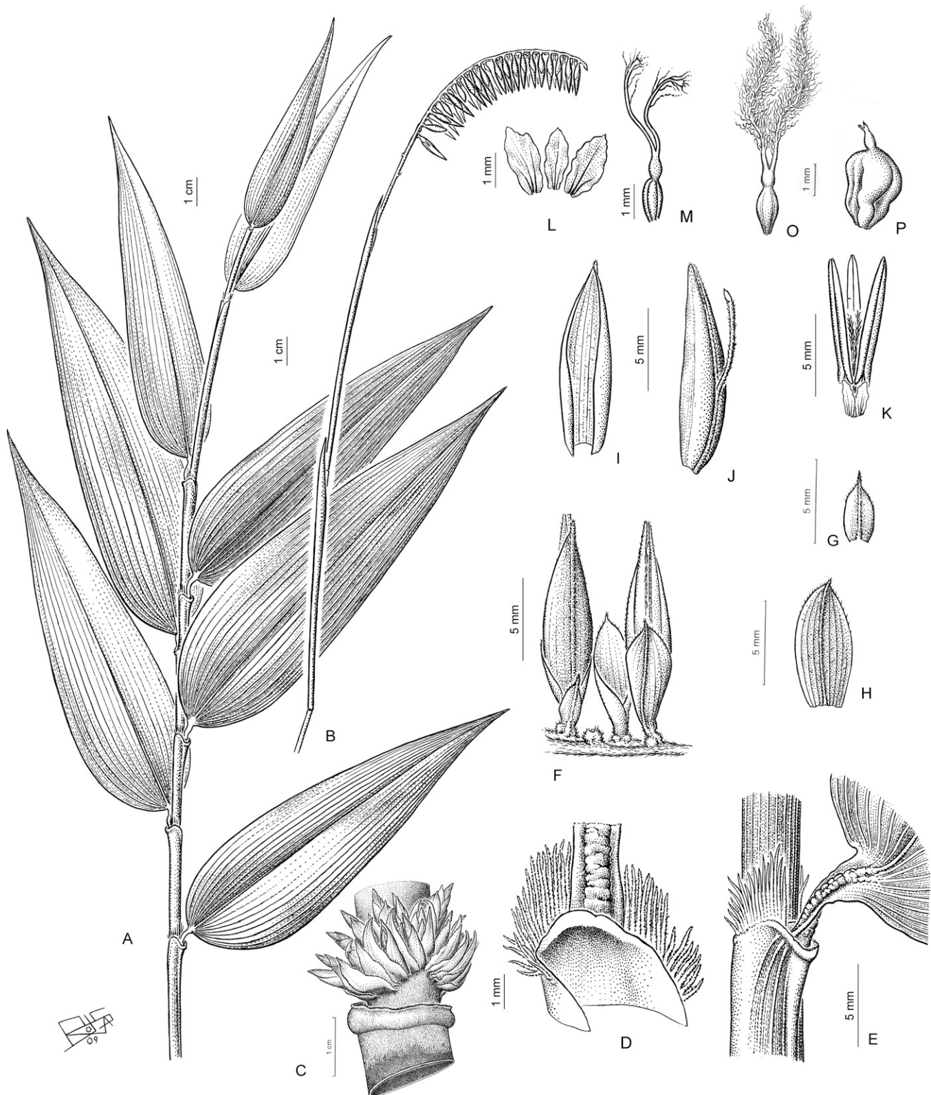
FIG. 3. Merostachys yungasensis . A. Branch complement. B. Inflorescence. C. Mature bud complement. D. Inner ligule, oral setae, and pulvinii, ventral view. E. Foliage leaf sheath, pseudopetiole, and foliage leaf blade, showing oral setae. F. Rachis fragment provided with spikelets and upper glume, ventral view. G. Lower glume, dorsal view. H. Upper glume, dorsal view. I. Lemma, ventral view. J. Palea and rachilla prolonged in an aborted floret, lateral view. K. Lodicules, androecium, and gynoecium. L. Lodicules, detail. M. Gynoecium with plumose stigmas. N. Gynoecium with plumose stigmas. O. Immature caryopsis. [A-B, D-O from Renvoize 4732 (SI); C from Solomon 12702 (LPB)].