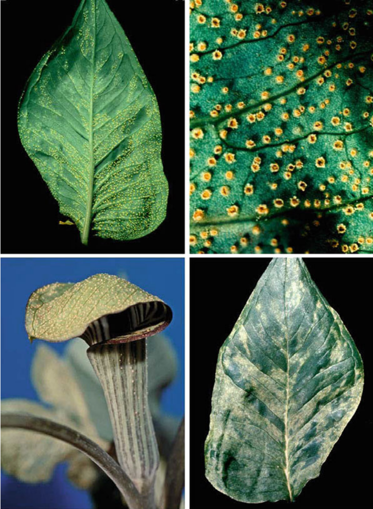
Plate 2 Rust on Jack-in-the-Pulpit caused by Uromyces caladii