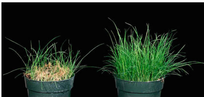
Plate 1 Dollar Spot on Turf caused by Sclerotinia homeocarpa